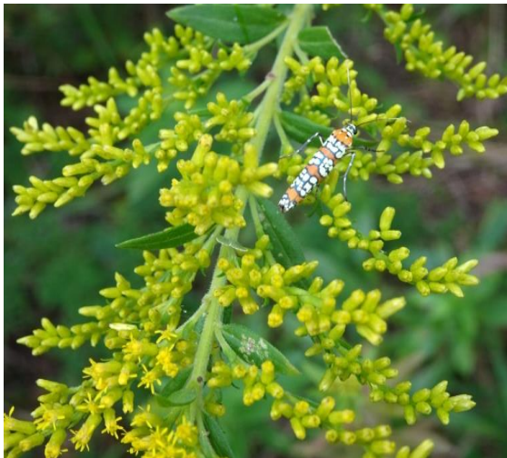
Ailanthus webworm moth on goldenrod

It's the best of times to engage! All outdoor events are COVID compliant and meetings happen via Zoom unless otherwise noted.