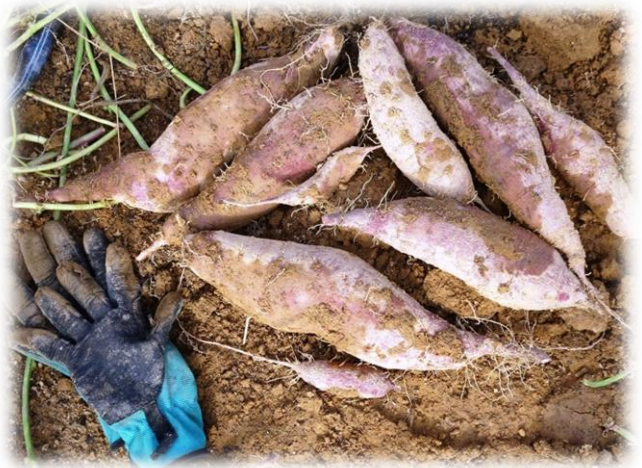
It's sweet potato time! Banner above: The barn's lower roof has its hat on