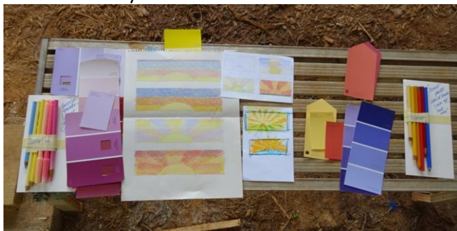
Cooking up colors for the barn