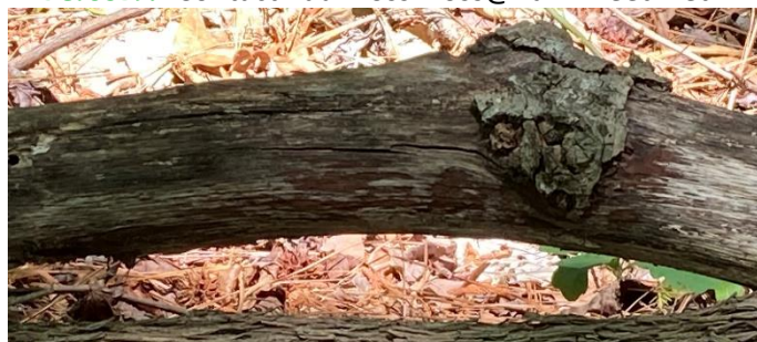
The wood gnome is watching!