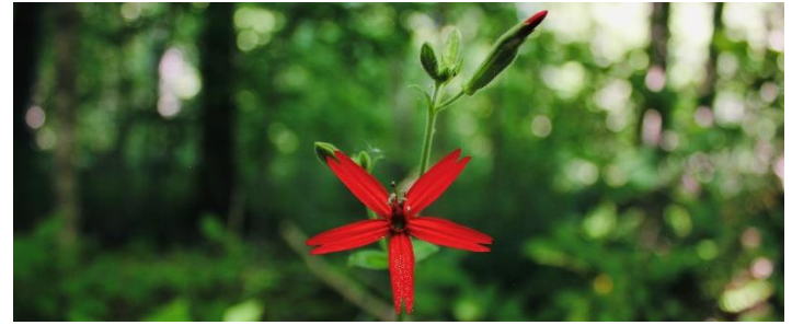
Blazing Fire Pink on the McGowan Creek Trail