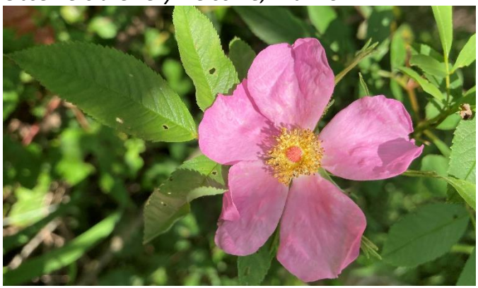
Native swamp roses grow in profusion in the wetland

RSVP to Anthony: <a href="mailto:weston@elon.edu">weston@elon.edu</a> Observers are very welcome, with RSVP