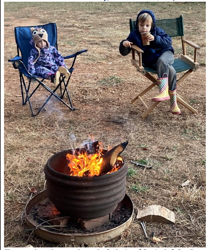
These two know how to relax at the Gathering of Gratitude & Goodies

◆Winter Solstice Ceremony, December 19, 3-5pm