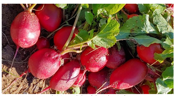
Thriving radishes

sign up & receive a Zoom link, contact Lisa.