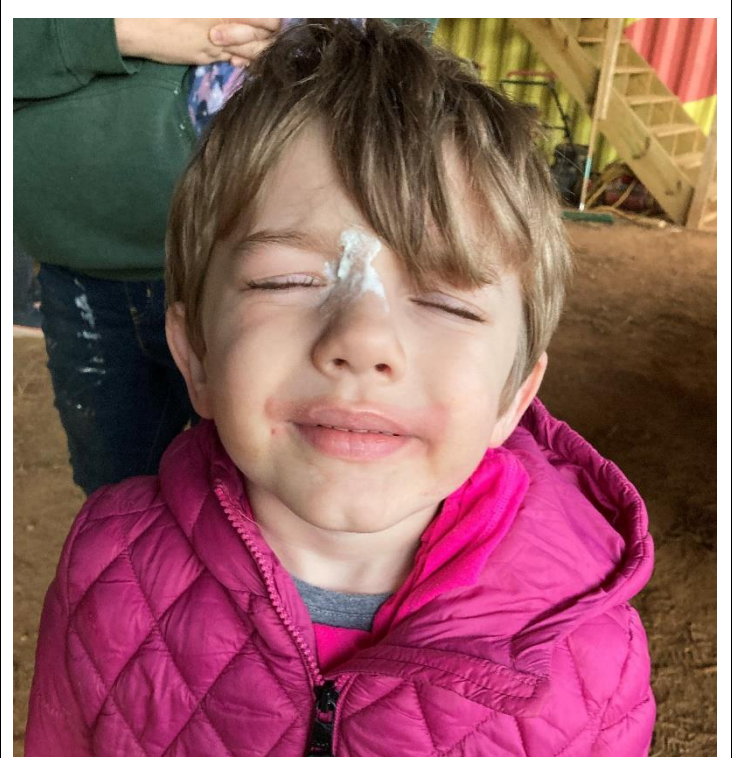
Whipped cream bliss, at the Gathering of Gratitude & Goodies