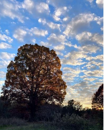
Night and day