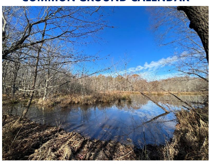
Banner—Casting long shadows, together Above—A winter wonder-wetland