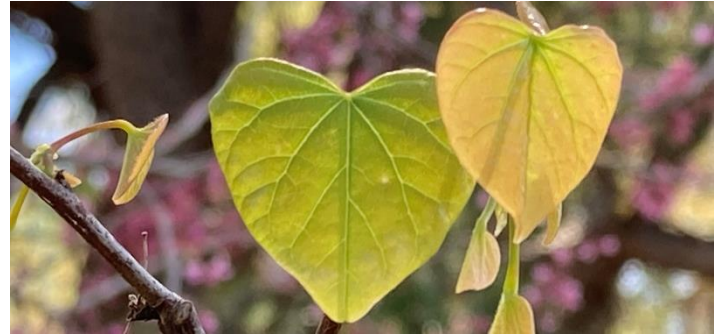
Redbud’s tenderhearted leaves

Come on over and tour the land and farm. Hear the latest information on housing, our time line, and learn how to become a member. This is a great way to meet other members and get a feel for what we are all about. Bring your family and friends, too!