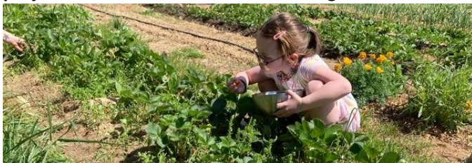
Serious strawberry picking!