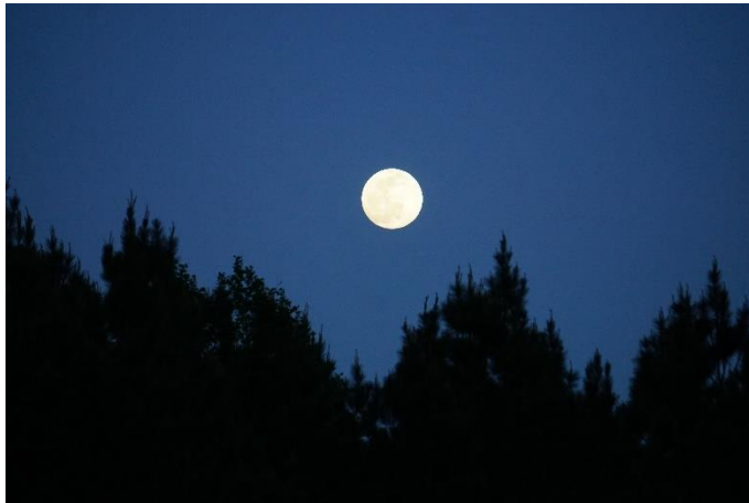
The Pink Full Moon of April

REGISTER: https://www.wayofbelonging.com/event-details/may-new-moon-ritual