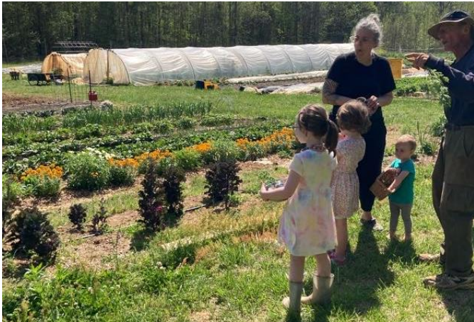
The littlest farmers