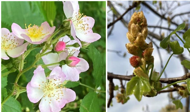
Native climbing prairie roses; sweet gum blossom—what a surprise!

Planning & Development: Housing reservations keep flowing in—contact Paul with questions: voss@hawkweed.net and Click here for the Reservation Form. ♦The loan application process is underway and we have (more than!) done our part, thanks to endless and patient work by Katy and Paul. But we’ve not yet been able to conclude the pre-application meeting process due to complications within HUD. Once these are resolved, we can start gathering architectural and financial/legal information and drafting policies for the first stage of the actual application. The entire process is behind schedule due to these hold-ups, but we are hoping that we can proceed faster through later stages due to more exhaustive preparation upfront. ♦ In other F&L news, Theresa is making a valiant effort to consolidate the ByLaws we’ll need for establishing the co-op—building on Paul’s earlier valiant efforts. A small group also including Katy and Anthony is tending to this process. Look for another Last Saturday session on Bylaws soon. ♦ Jonathan Lucas, our architect, is preparing structural drawings so that we can talk seriously with HUD and potential contractors about straw-bale construction. Bobby Tucker and Nick Lauretta are deep into site planning. Site layout drawings have been shared with Land Stewardship, allowing us to stake out and mow village paths and house and Common House locations more accurately (come and see). Plans are consolidating!