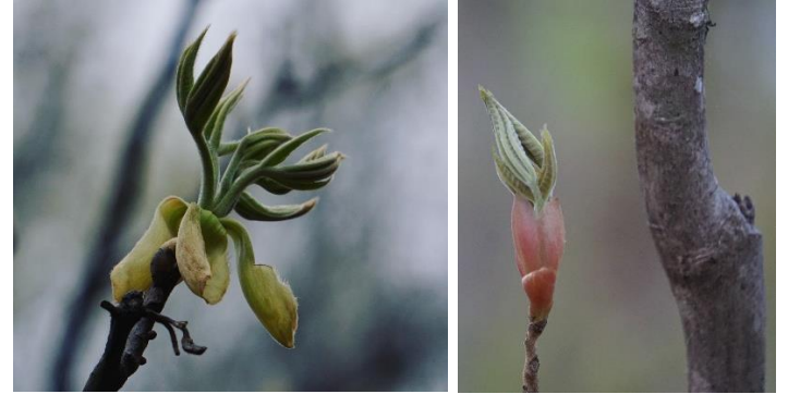
Hickory leaves burst out of their confining buds

Everyone's invited! This is a simple way to hang out and enjoy getting to know each other. This will be very child-friendly and we'll have a camp fire!