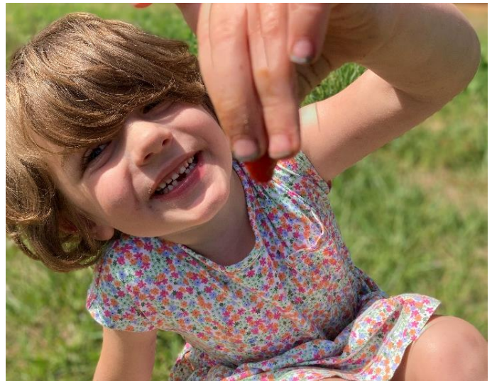
The joy of picking and gobbling fresh strawberries! Banner above: Wild azaleas!