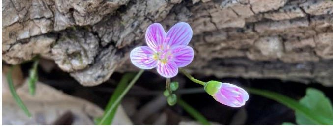
Spring beauty, one of the earliest flowers of the season