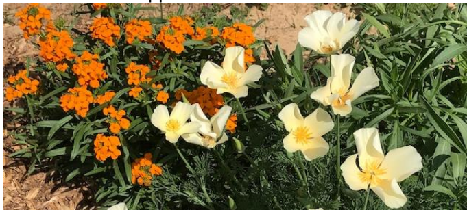
Wallflowers and poppies for the bees!

Consider running for a 2-year board position with Weaver Street Market , our local food coop. Board members get training in cooperative skills and receive an annual stipend in store credit. Applications will be accepted in June and the election is held in September. Sign up for the coop newsletter for news of this and other volunteer opportunities.