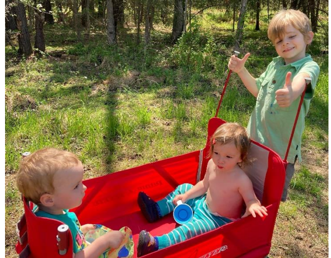
It's all good!