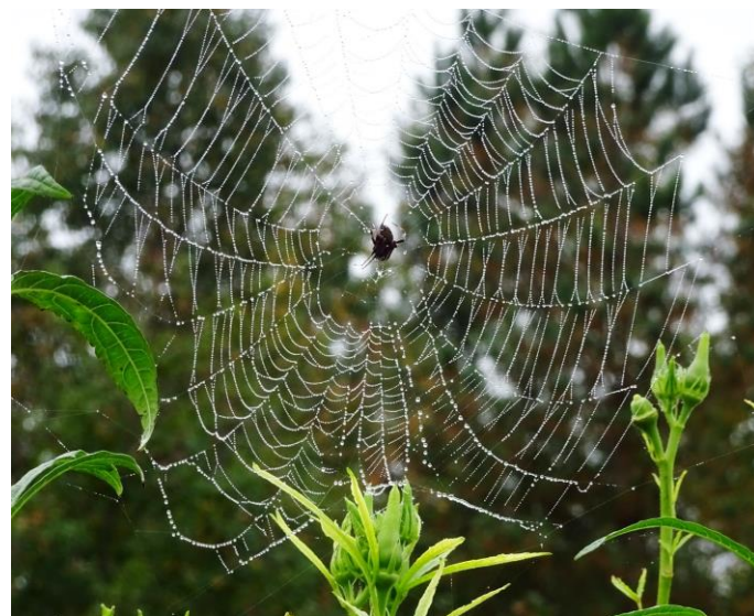
Not so itsy-bitsy spider