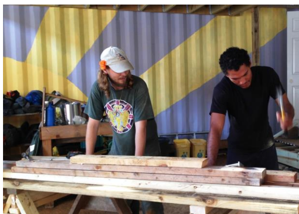
Working the wood