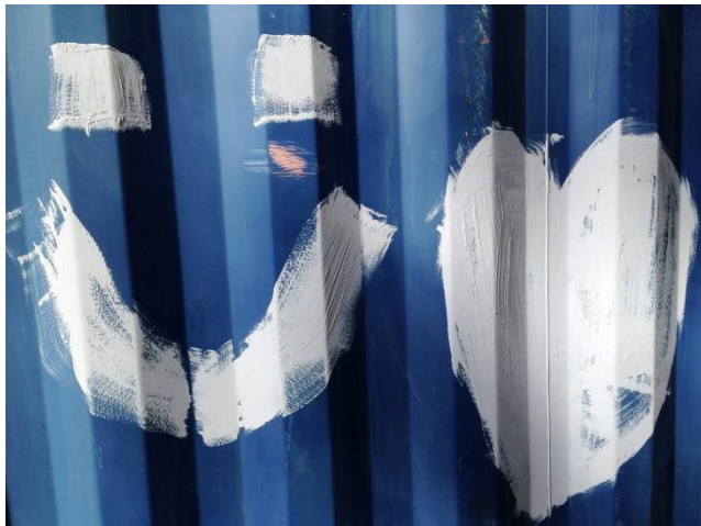
Happiness and love for the barn (painted by Rielle, aged 10)

Ren brings this book to our attention this month: The Token: Common Sense Ideas for Increasing Diversity in your Organization , by Crystal Byrd Farmer. This no-nonsense, provocative, humorous, and accessible guide is for all well-meaning people leading progressive organizations who acknowledge the need for diversity but don't know where to start.