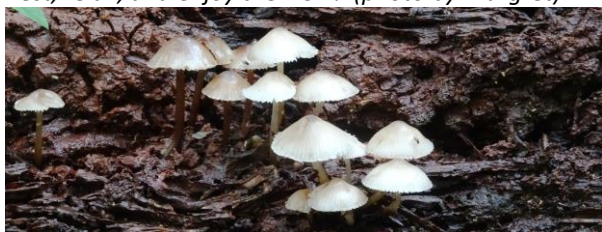
Delicate mushroom patch