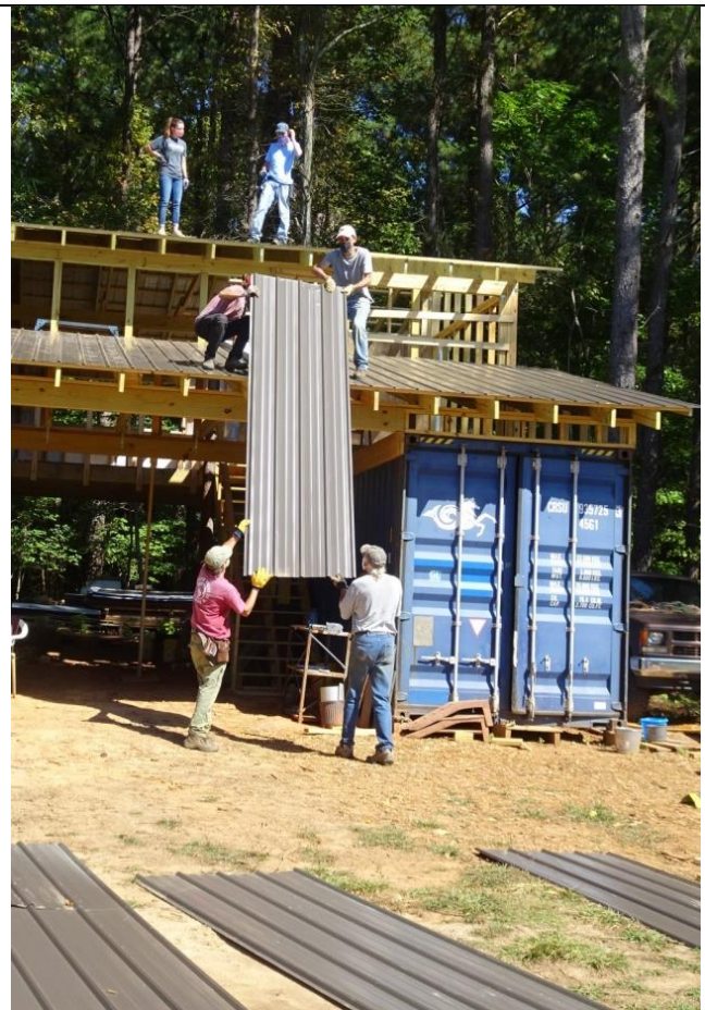
Raising the roof!