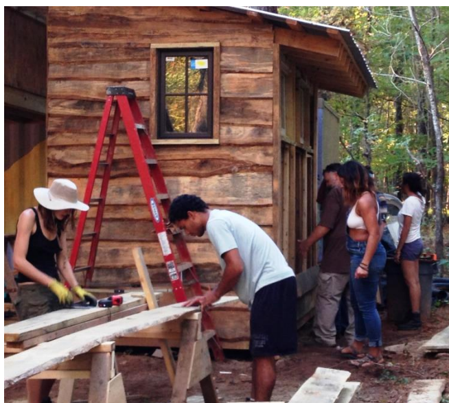
Natural building students from Iowa lay down pine-slash siding and slip straw at the bath house Banner above: Turnip washing line