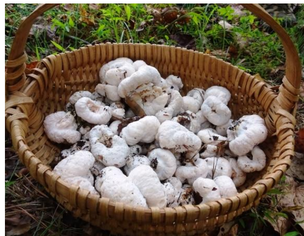
Shrimp of the woods mushrooms—dee-lish!