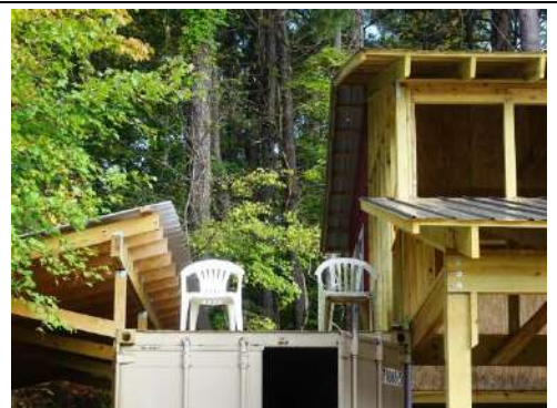
Can we sit down now and enjoy the view???