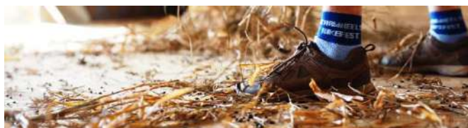
Stomping the crispy black bean pods in the barn

It's never been more clear that humans need to reach for ways of living that foster connection, aliveness, thriving, and balance with each other and the natural world. The up-tick in membership we've experienced is one reflection that we're on the right track. But it's not easy being green! We're persisting. And we could use some help. So if you feel inspired by what's happening here, come on in—your input will make a contribution extending beyond yourself; to the children, and to our beautiful and priceless Earth. Read on and check out the photos at the end —there's a place for you at CGEV!