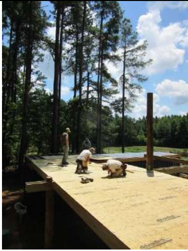
Putting in the second story floor