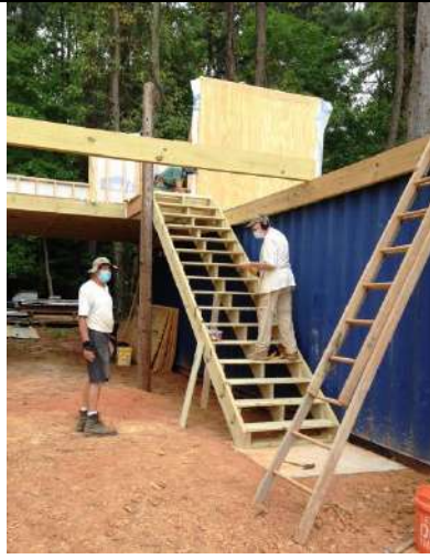
The stairway's in place