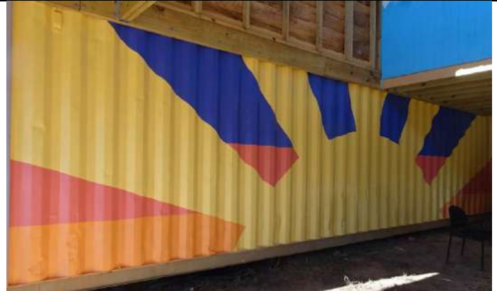
The Sunset Mural is complete on the western wall