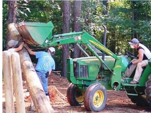
Hauling the salvaged telephone poles