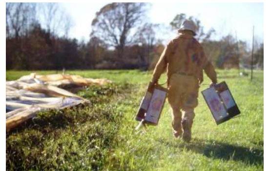
Left column, L-R: Earth Skills Sundays with Gumby Montgomery, tracking; finding edible plants; high summer oak; crew cleaning up the detritus of the soils testing process; ripe elderberries; jack-in-the-pulpit; peanuts, anyone? Rattlesnake plantain orchids Right column, T-B: Seeing Stars Farm juicy fruits; Community Farm Initiative team plants 600 feet of root veggies; Students from Iowa place slash siding from our own pines on the bathhouse walls; Doug walks towards the sun