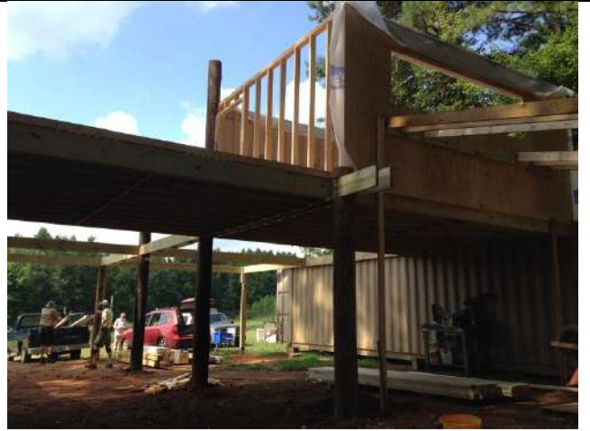
The corner room takes shape