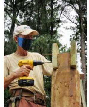
George's capable hand