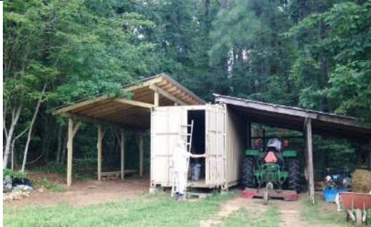
"Before" Two tractor sheds and a shipping container