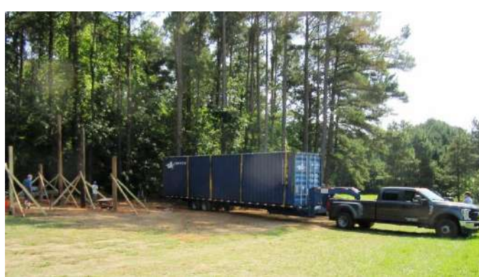
The second shipping container, which serves as the east wall, is delivered