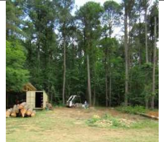
After removing trees and one shed