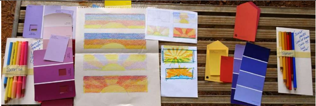
Sunrise/sunset concept design with sample color palettes