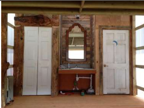
The bath house now nearly finished, with running water