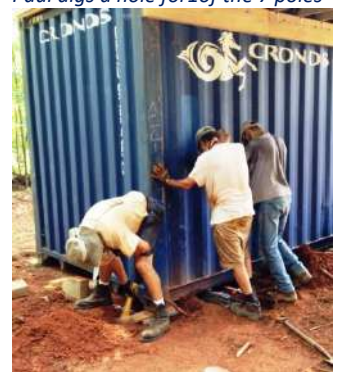
Leveling the shipping container (!)