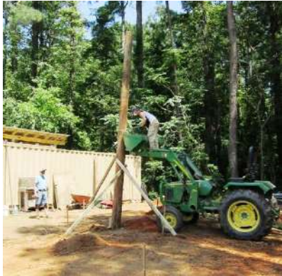
Brandon straightens the center pole