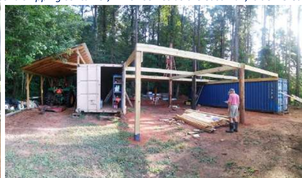
The bones are in place