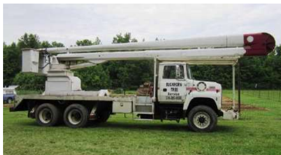
Buckhorn Tree service comes to clear the site