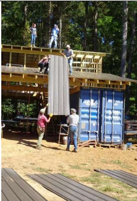
On goes the metal roofing