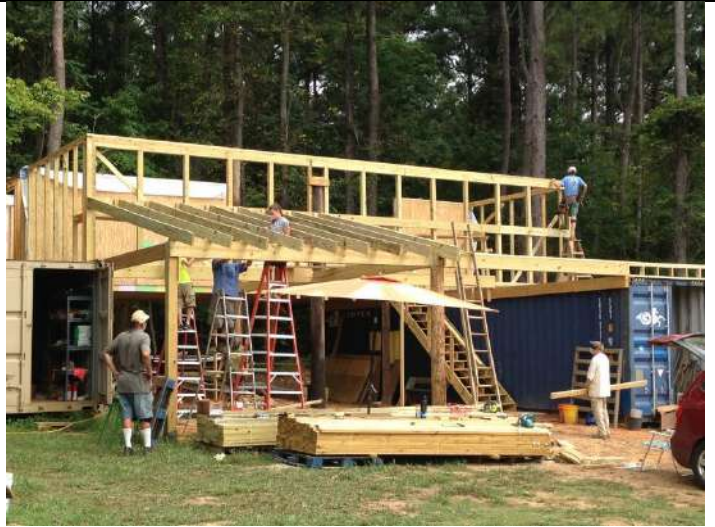
Fabulous work crew gets to work on the roof