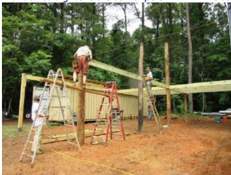
Placing the cross beam—very carefully