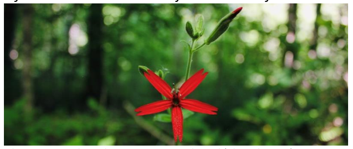
Blazing Fire Pink on the McGowan Creek Trail