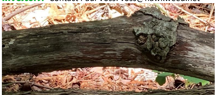
The wood gnome is watching!