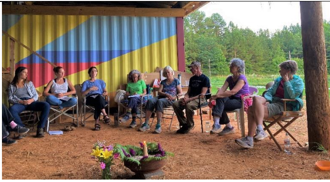
Snippet from the Juneteenth circle and potluck gathering at the barn