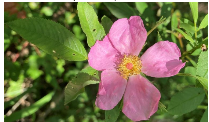
Native swamp roses grow in profusion in the wetland