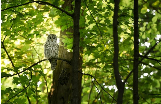
A breathtaking view of a barred owl