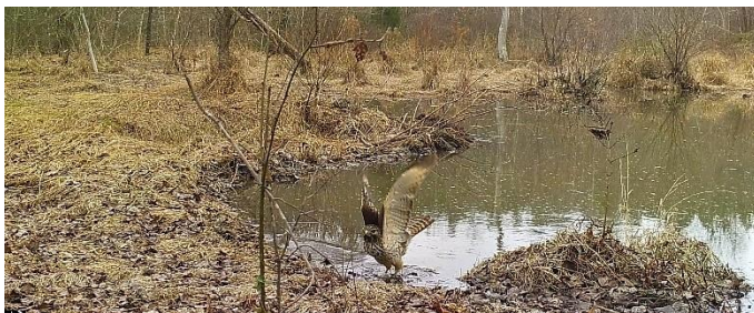
Trailcam snaps: (above) Great Blue Heron strolling on the McGowan Creek beach; Hawk swoops in for a wetland landing