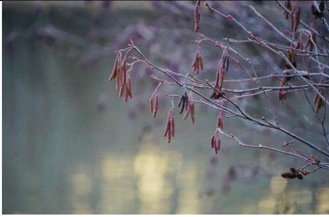
Smooth Alder tree branches over the pond