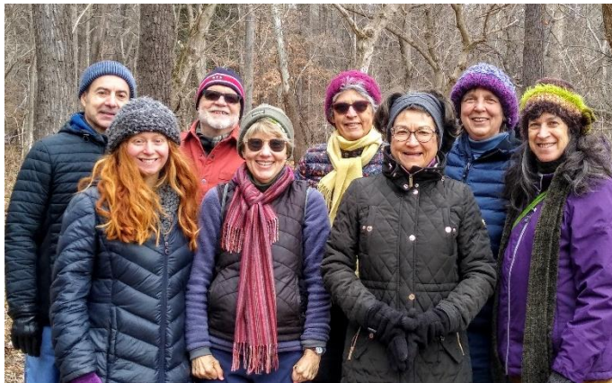
The intrepid "Take a Hike" group shares warm smiles on a frigid day.

Governance & Training Circle: G&T members will be contacting ALL NEW MEMBERS both to sign up for OnlyOffice training and to participate in a new approach to governance training, the Empowered Learning Circle . These self-directed groups will learn excellent content about sociocracy AND have the opportunity to practice what they learn. We're looking forward to working with all of you towards creating a governance-literate community!