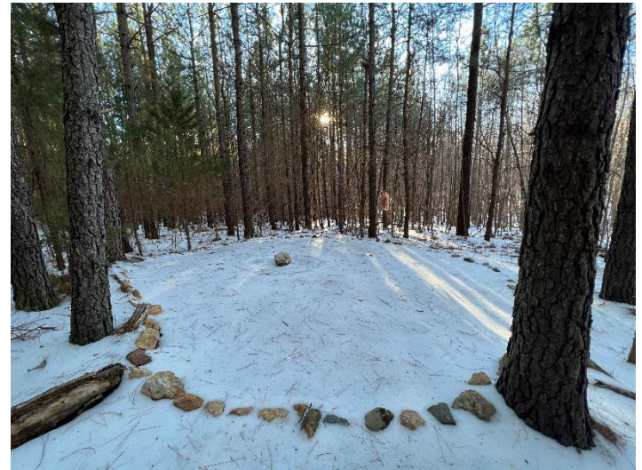
Sunshine gleams on the center stone circle