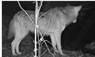
The trailcam captures a turkey by day and coyote by night.