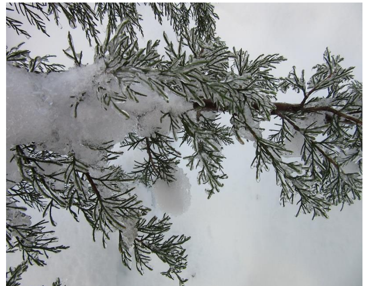
Snow falling on Red Cedar