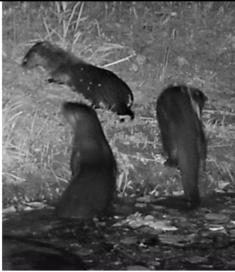
A noble buck's remains; River otters cavorting in the wetland