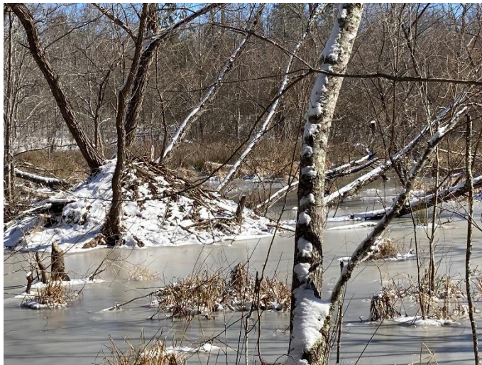
The tip of the beaver lodge atop the ice

Membership Circle: January has flown by! At the top of the month 40 members came together to talk about what we mean by living in justice in our community. The rich list of ideas generated in the workshop will serve as a launching pad for future action. More to come. A second workshop, Diversity Training , will take place on February 12th. The details are below. ♦ Building our membership is central to the work of this circle. Towards that end, we are focused on revising the membership advancement process and also expanding the Buddy Program for visiting and exploratory members. Beginning in February we are reaching out to all exploratory-through-engaged members to volunteer to be a Buddy to a new visiting member. This is a rewarding way to contribute to the growth of our membership.