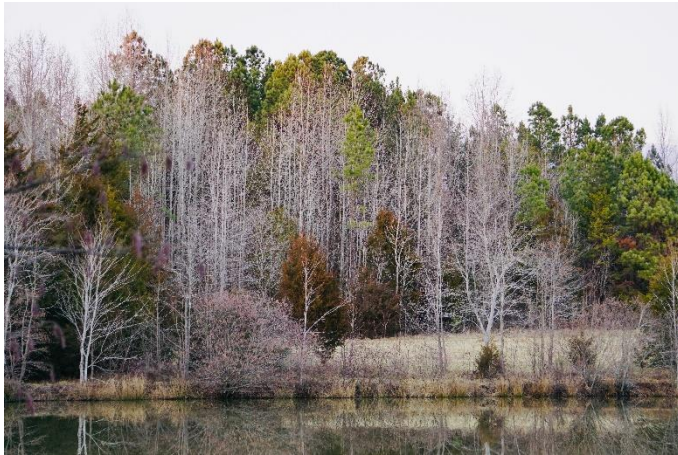
Winter-bare trees surround the pond

Planning & Development Circle: P&D continues charging along with extensive design work both for the village site and the residences and Common House. Our engineers have produced a draft village plan providing for overall site grading, swales, paths, and roads, along with house and Common House siting, as well as parking. We are working it through with them along with community members with expertise in this area and in relation to the farm edges and interface with the village. Though of necessity we have to work around some constraints and limits, there are also some exciting changes and improvements to the site plan shortly to be unveiled!