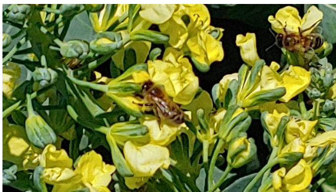
Bees feast on broccolini blossoms

On the horizon: further explorations of what it means to be an agrarian community and live under the umbrella of how to best care for this particular patch of the larger common Gaian ground in the months and years to come and for the seven generations yet to be born. Read the whole story with luscious pictures here.