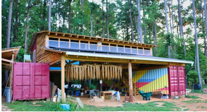
Farm-grown garlic drying in the solar-powered barn

There are many stories that could and should be told about what transpired on the land at Common Ground in 2021. Here are few headlines to inspire you to read more here , complete with photos from 2021: