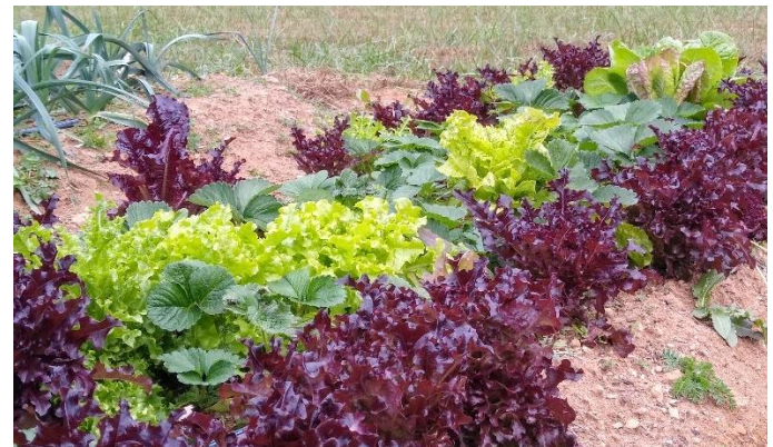
This fresh and delicious salad mix could be yours through Doug's CSA!

Feeling gassy, bloated, or in pain? Not sure what could be causing your tummy upsets? I am offering 30-minute complimentary coaching calls for anyone looking for guidance which combines and integrates a wide spectrum of knowledge and techniques. Check out my website: www.root2risewellness.org .