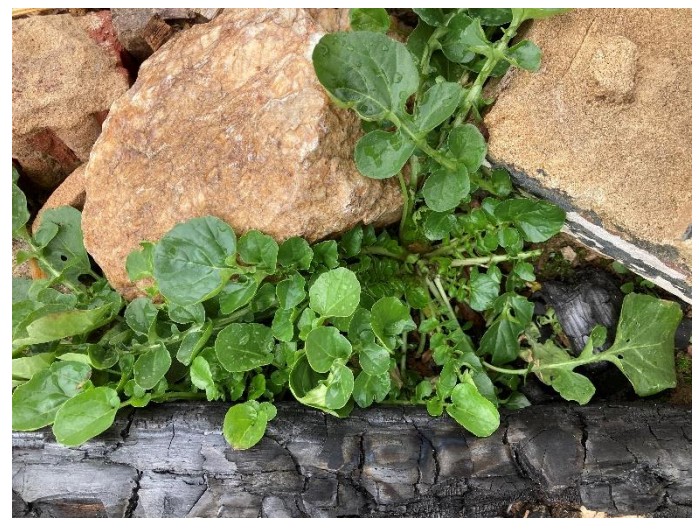
Spicy, wild mustard "creasy" greens are growing in the far field. Yum!