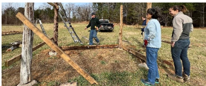
Randy, Kathleen, & Michelle are building a woodshed

FIC offers many short events and continuing courses that are highly relevant to our work at CGEV. Visit this website ( https://www.ic.org/learn/ ) to see the array of intriguing options for the months to come.