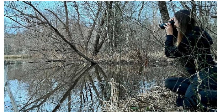
Michelle scans the wetland for wildlife