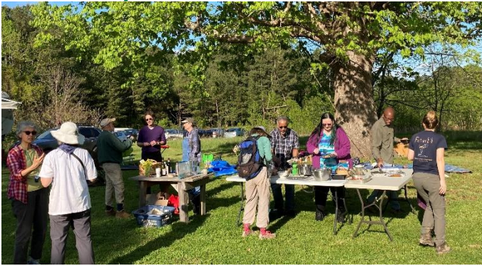
The July Celebration Open House potluck

Headline news is that the Membership & Marketing Circle has divided into two equivalent Functional Circles, giving each the ability to focus on their very vital—and very different—tasks. The Membership Circle has evolved with new members who have challenged us to re-think or re-prioritize some of our initiatives. Here are some notables from 2021. Click here for more.