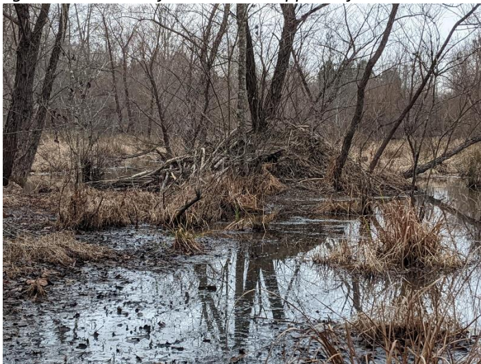
The wetland beavers' common house!

This seasonal celebration comes to us from the Celtic world. Historically, this day was called Imbolc (lamb's milk) because the lambing season began. It is the promise of renewal, of hidden potential, of earth awakening and life-force stirring. We welcome the growth of the returning light and witness Life's insatiable appetite for rebirth.