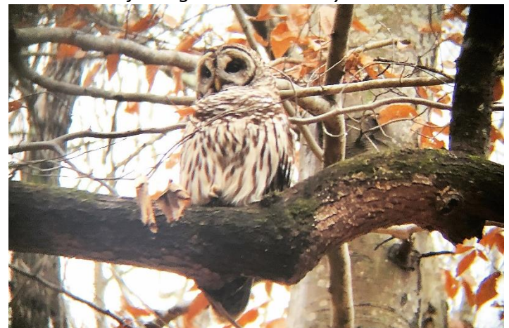
Barred owl, hanging out by McGowan Creek