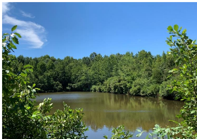
Persimmon pond

This retreat center was purchased in 2019 and re-purposed to become a community organizing training center where leaders who are working for social justice can for nourishment by this sacred space, leadership development opportunities, and contemplative silence.