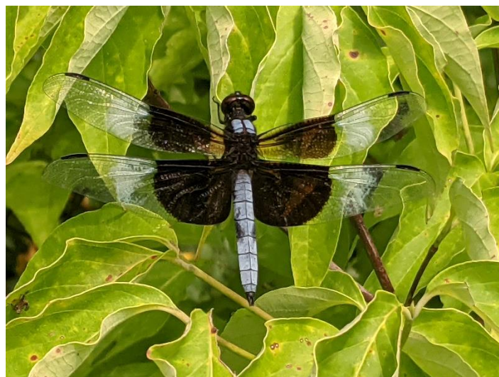
Widow Skimmer dragonfly alights on a bed of Dogwood Banner above: Walking towards home