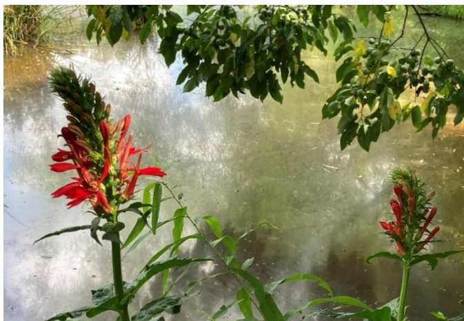
Cardinal flowers blazing in the wetland near persimmon boughs laden with ripening fruit in the wetland