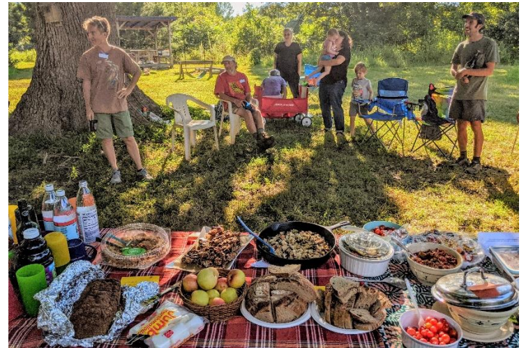
A potluck in the shade of the Grandmother Oak during the day's "golden hour"

Gathering for the first time! If you have an interest in building strong and effective internal and external communication policies and systems, please consider joining us! Observers are welcome, members needed.