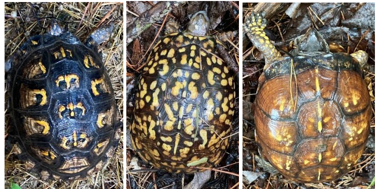
Three flavors of box turtles ambling along the path to the pond!