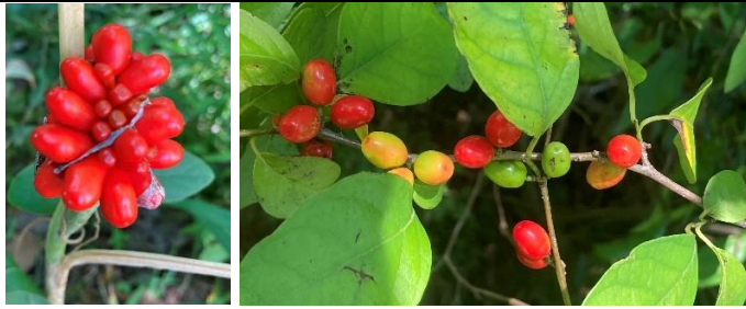
The colors of fall—Jack-in-the-Pulpit seeds & Spice Bush berries