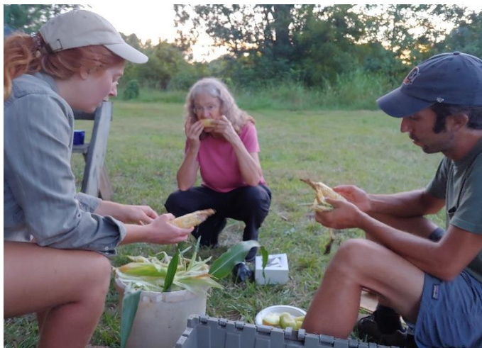
One of summer's joys—sweet corn from the farm

The New Moon is a time for introspection, heightened intuition, surrendering to the unknown, opening to magick & conjuring visions. Together we will align our energy to the potency of new beginnings as a way to set the stage for a new month ahead!