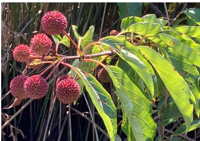
A buttonbush bough going to seed in the wetland