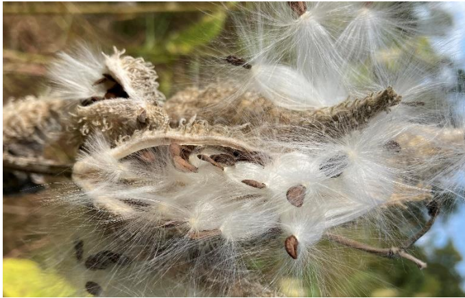
Milkweed pods release their seeds to the wind