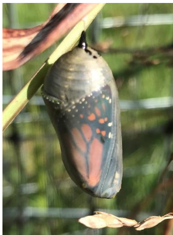
Shiny new chrysalis; butterfly on the brink of busting out