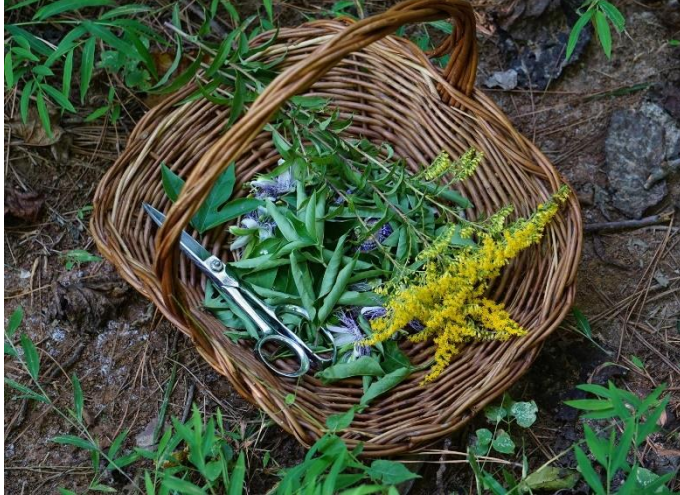
An autumn goodie basket

The bright light of the Full Moon reflects a time of illumination and abundance. This is a powerful time to give thanks and to acknowledge the beauty of life and all you have brought into being. Together, let's honor this moment of culmination!