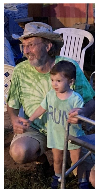
Quai's music captivates listeners of all ages