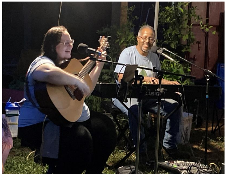
A little night music by Ren & Quai—come hear them at the Fall Fest!