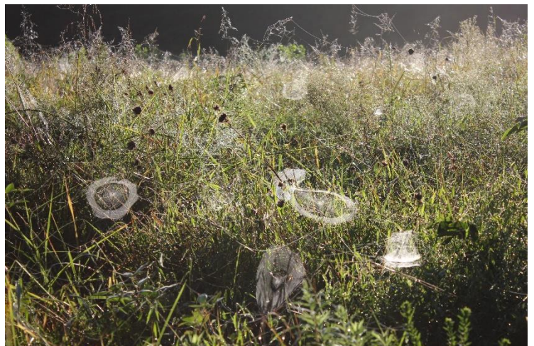
Mysterious spider's webs hover over the meadow