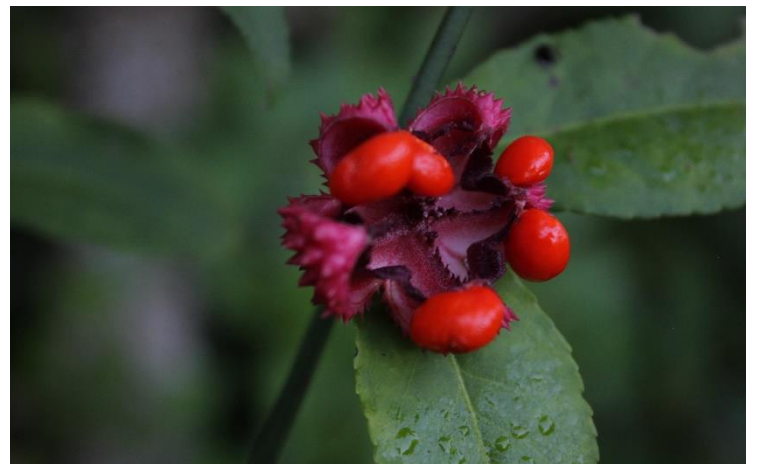
Hearts a-bustin' shows its autumn seed-pod colors

Perfect for people exploring CGEV, this session includes an up-to-date overview of where we are now, what's next, and how you can get involved and contribute. You'll hear from other members and ask your questions. It's a great way to learn a lot, fast!