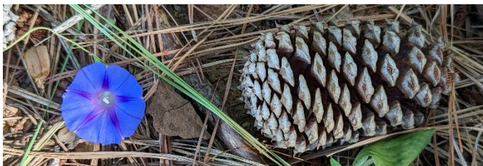
Fresh and spent lying side-by-side

FIC offers many short events and continuing courses that are highly relevant to our work at CGEV. Visit this website ( https://www.ic.org/events/ ) to see the array of intriguing options for the months to come.