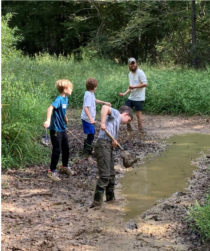
Searching avidly for macroinvertebrate creatures in the muddy wetland waters

♦ The Website Subcircle has been hard at work researching and setting up a discussion forum that will soon be announced via email and accessible through our website's Members Only area. We are very excited about this! Stay tuned for that announcement! Thanks to the Membership Circle for requesting this.