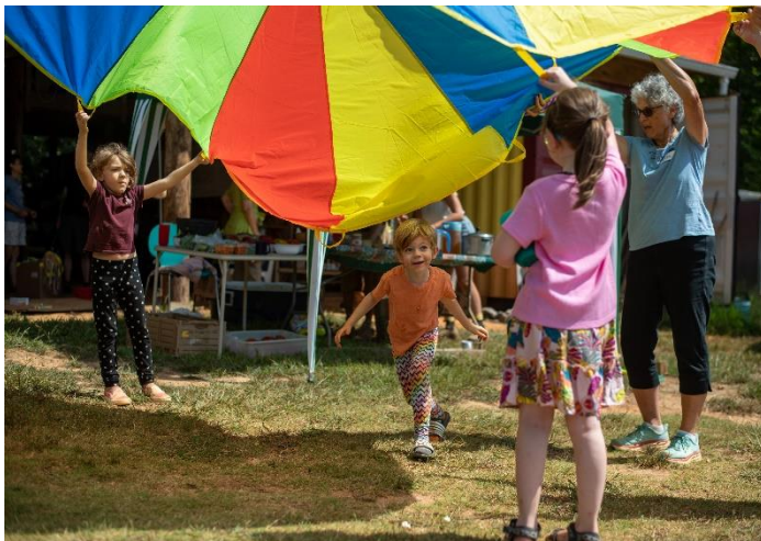
September Open House frolics