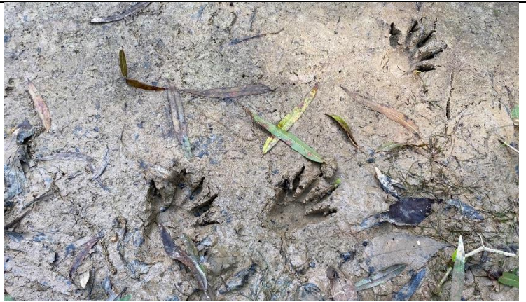
Tracking racoons in the wetland

♦ The next Empowered Learning Circle (ELC) sociocracy training sequence is being scheduled for 4 consecutive Sunday afternoons, 12:30-2:30, from October 16 to