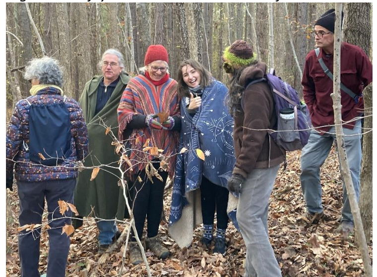
Joy in the woods!

Meet up at the Eno River Confluence Natural Area and take a lovely hike where two branches of the Eno come together. Enjoy warm drinks and snacks afterwards.