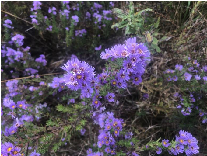
Amazing asters, late blooming and dazzling

♦ The Earth Connection Sunday hosted by the HeartWeavers Subcircle drew a crowd eager to learn about our trees, despite the chilly temperatures. EB and Hope meandered through the Black Walnut grove and into the woods, sharing stories and inviting reflections about specific species. Thanks to Doug for organizing this event!