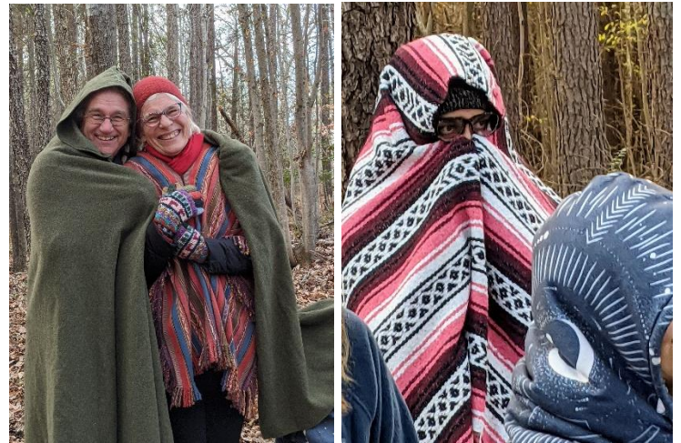
Finding warmth on a chilly day – inside and out