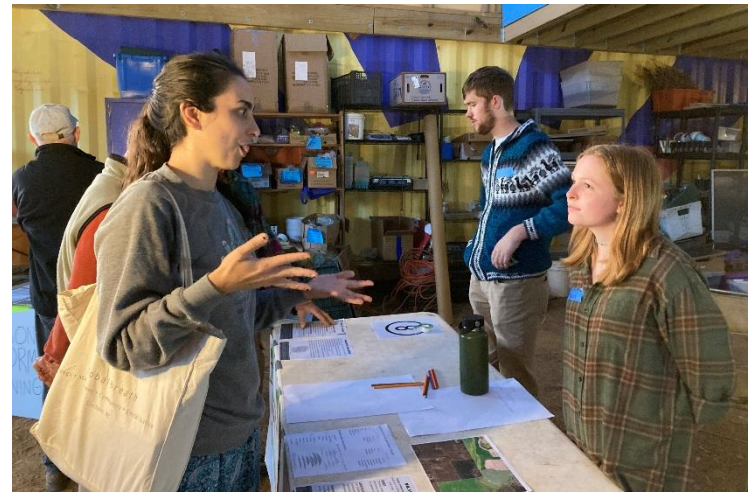
Members talk with Elon students about their findings

question prompts to help us get started, and we also share whatever is alive for us in this warm and accepting environment. If you thirst for genuine connection, join us when you can.