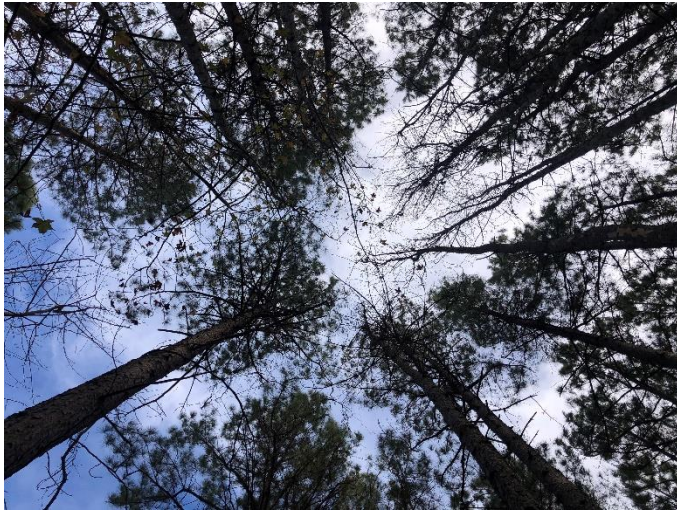
Loblolly pines stretch up to the clouds

website. However, we have since received feedback that many people never received their initial invitations and passwords, and those who did ran into technical difficulty. We are working to understand the issues and resolve what went wrong, and we will try again once we do. Watch your email for updates!