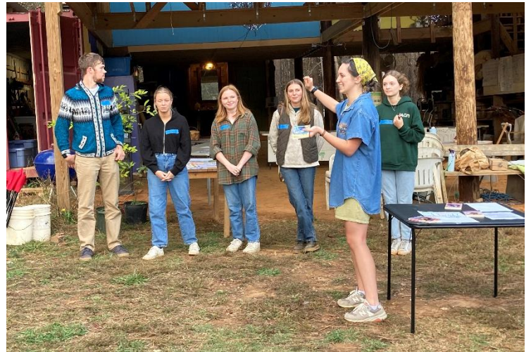
Students from Elon University unveil the results of their engagement with the CGEV forest in an interactive and creative way