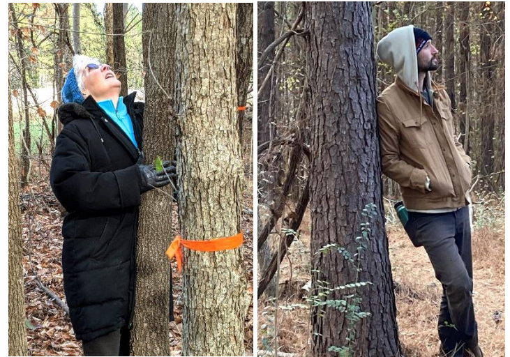
Hope and EB get up close to the trees

♦ December 22: Lunar Wisdom Circle: New Moon Ritual | 7 - 8:30pm | Zoom