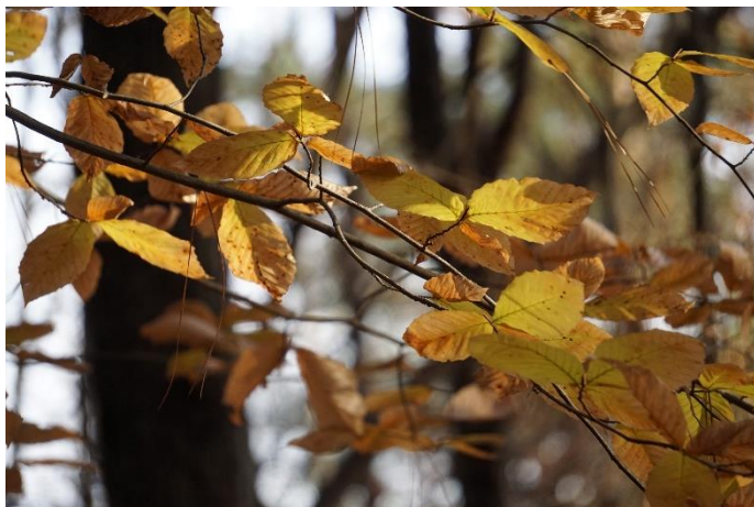
Beech trees hold onto their leaves all winter long

We have an enormously creative and resourceful group of members capable of imaginatively addressing these questions. What's particularly fascinating is that the group of folks who heard the disappointing news on the 19 th didn't panic. No Zoom squares suddenly went blank. Folks began quickly to offer their thoughts and ideas. It's abundantly clear that our remarkably resilient members (especially those who are relatively new to the community) are ready to roll up sleeves and get to work. Clearly, now is the time to mobilize ourselves (each and every one of us!) to help CGEV possibly reconfigure both the planning process itself, and the ultimate goals we set for a reimagined community (in every aspect of our community life). All Circles are dedicating themselves to this task, and they will need your help. Together we can do it!