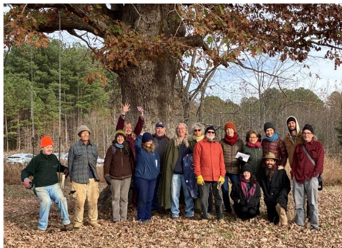
A good crowd showed up to get to know our trees!

Communications Circle: In the coming month, CommC will re-access our human resources in terms of who is willing to do what work along with realistically incorporating the priorities that GC will be setting soon for 2023. Going into October we were very excited about the influx of energy, but as we went into November it dropped off suddenly and dramatically. Many projects we thought were moving forward are now on a back burner until this situation changes. Please contact Quai if you would like to explore contributing to the efforts of CommC or any of its Sub-Circles or Task Groups: quaifranklin@gmail.com