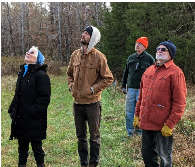
Looking up at the treetops—what will they reveal?