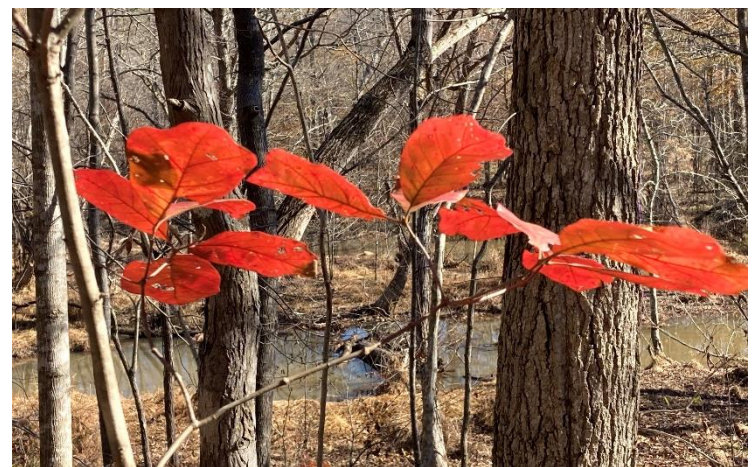
Young Blackjack Oak leaves paint the wetland

This is an excellent way to get to know members, see the land, learn about the community, and enjoy delicious dishes!