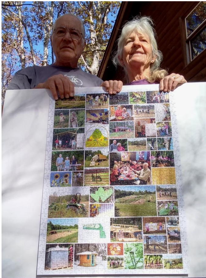
Come on, give it a try!