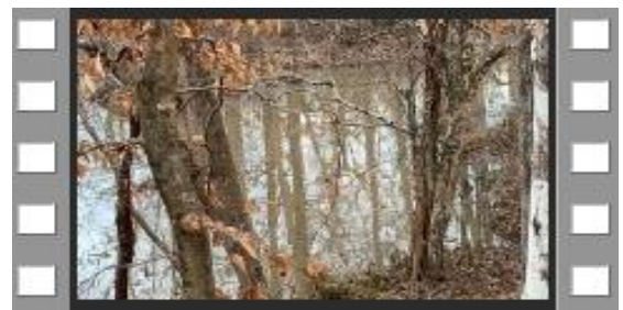
Click on the image to watch a beaver swimming in the wetland

FIC offers many short events and continuing courses that are highly relevant to our work at CGEV. Visit this website ( https://www.ic.org/events/ ) to see the array of intriguing options for the months to come.