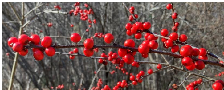
Winterberry holly in the wetland

G&T guided a process to evolve our Circle structure by helping our Functional Circles (FCs) to create Subcircles and Task Groups to focus on specific activities. This has enabled FCs to stay “right sized” while including more members in their work. And it’s a work in process. ♦ G&T organized the new monthly Community in the Round , where all members are invited to share information, offer feedback on topics, get to know each other small groups, and learn about ways to contribute to Circle tasks and projects. With help from Theresa, we also led a December General Circle retreat to consider 2023 priorities across the Circles and to regroup after the discouraging costs estimates received in November. ♦ We’re grateful to our small but mighty group—Becky, Hope, Quai, and Ruth—for keeping this governance ship afloat in our own unique and invaluable ways.