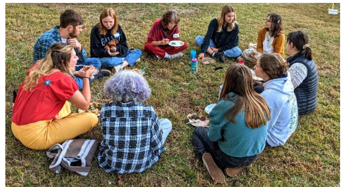
Elon seniors circle round and talk with members about their project

This Group is reading a new book: The Heartbeat of Wounded Knee: Native America from 1890 to the Present, by David Treuer