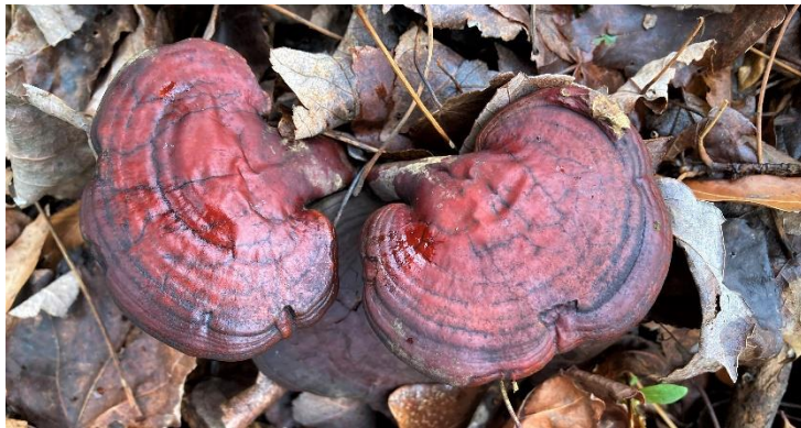
Medicinal Reishi Mushrooms appear in several places on the land

on a variety of topics. We're excited about this because it's the only place we have as a community to voice an opinion or idea that everyone else has access to and can respond to. WE STRONGLY ENCOURAGE YOU TO CHECK IT OUT! If you are an active member, keep an eye out for an email with an invitation and instructions to log in. We believe this will be a powerful tool for members staying connected. ♦ Yes, we are in uncertain times but we have heard the community say "in this time of uncertainty let's focus on getting to know each other better; let's have workable avenues for communication; let's continue to educate new members and bring them through the membership process; let's find a path that fits the people that we are." The members of MC are excited to be working on all of these important things. Please join us if this excites you, too!