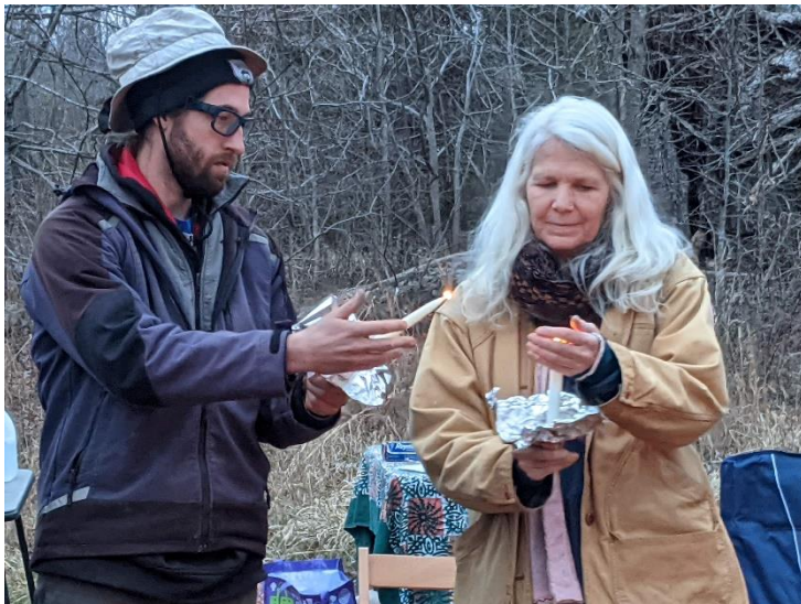
Lighting a candle for one another (Photo: Shells)

♦ Re-vamped the Membership Process with fewer levels, clearer expectations, and steps for advancement posted on the website. ♦ Increased the buddy pool with recruitment and training. ♦ Facilitated vaccine dialogues and conflict resolution conversations. ♦ Established an Affordable Housing Task Group jointly with the Planning & Development Circle. ♦ Hosted a full year of Open Houses and Fresh Take Info Sessions geared to newly interested people. ♦ Labored to improve barn so it can easily be used for events and also organized all the things needed to host a potluck in one place. ♦ What's next? Members have needs to communicate with each other , whether to announce a program, discuss community issues, look for a home to rent, or connect with others around a common interest. We urgently need to dialogue and share our thoughts, feelings