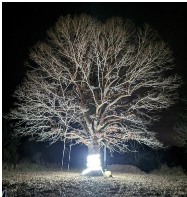
Winter Solstice under the glowing Grandmother Oak Banner above: Keeping the fire burning