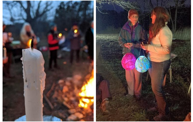
Warm flames and glowing orbs at the Winter Solstice ceremony