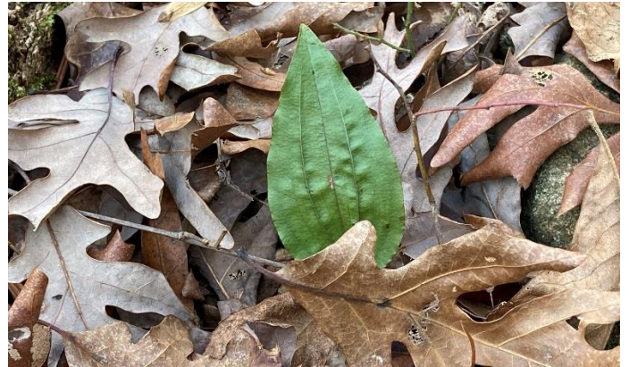
A fresh Cranefly orchid leaf pops up out of last year's oak leaves.