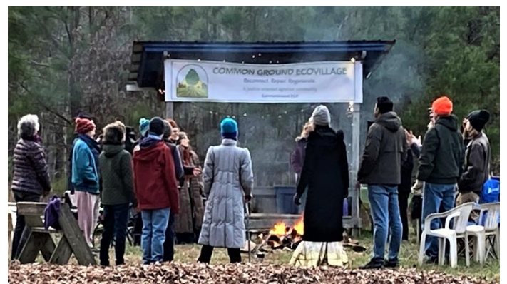
Coming together under the Common Ground Banner

Come and get to know other members on a much deeper level as we practice both compassion and vulnerability. We offer question prompts to help us get started, and we also share whatever is alive for us in this warm and accepting environment. If you thirst for genuine connection, join us when you can.