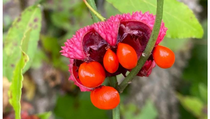
Hearts-a-bustin seed pod, explosive with color

group. Options include forest thinning, trail tending, dam clearing, and others.