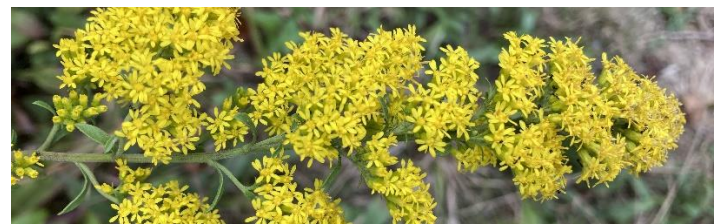
Goldenrod provided autumn beauty and an important source of nectar and pollen for the honey bees.