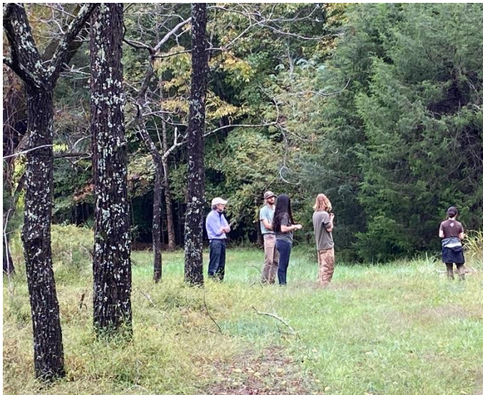
Members breathe in the beauty of the black walnut grove

We strongly recommend these 2-day virtual trainings as a way to begin a shared conversation about racism and social justice at Common Ground Ecovillage. Click here for information and to register.