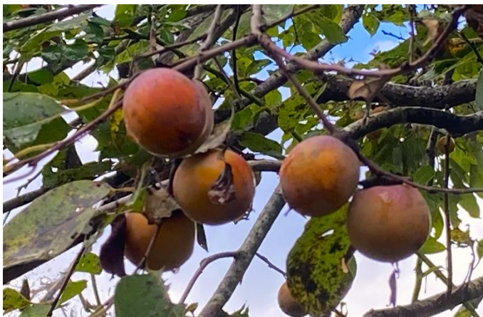
Delicious wild persimmons are ripening on the tree