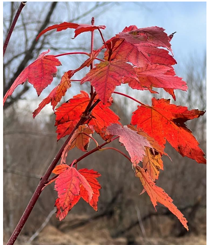
This Red Maple lives up to its namesake