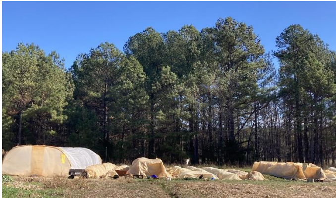
Farmers protect the tender plants from freezing temperatures.

discuss our development options and other topics important to our members. There are also sections dedicated to Functional Circle work and an area for general community topics, along with a section containing helpful instructions.