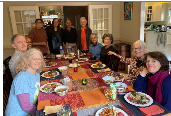
An abundant gathering of gratitude at the Nest

specific development recommendation, increasingly widely via email notices, website, meetings such as the upcoming Community in the Round, and a new Member Forum discussion board. ♦ Of special note is that a new Orange County Development category, called a Flexible Development/Conservation-Cluster Option, has recently opened up , which looks like it could allow us to build a smaller, simpler, less expensive version of the original master plan. After long years of struggling with restrictive and zoning options, and even feeling hemmed in by our own Master Plan—over eight years old now—this just possibly could be a dramatic unburdening and breath of fresh air we've been waiting for. We're looking very closely at it now, as well as honing three other quite different alternatives to offer the community some very fundamental choices. ♦ Please stay aware that as things seriously heat up, everyone's efforts are going to be called upon and needed. There are already calls out for new and/or energetic members to take on specific tasks that P&D (and other Circles) cannot—and there will be more! Don't stand apart, not now, especially.