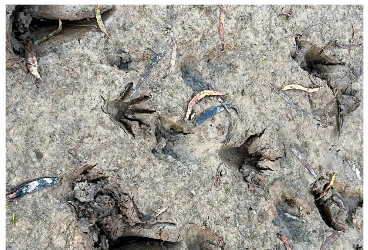
Raccoons leave their tracks in the soft wetland ground