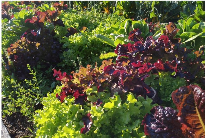
Emerald and ruby lettuce thrive in the heart of winter

Don't let this happen! Vote on March 5!!