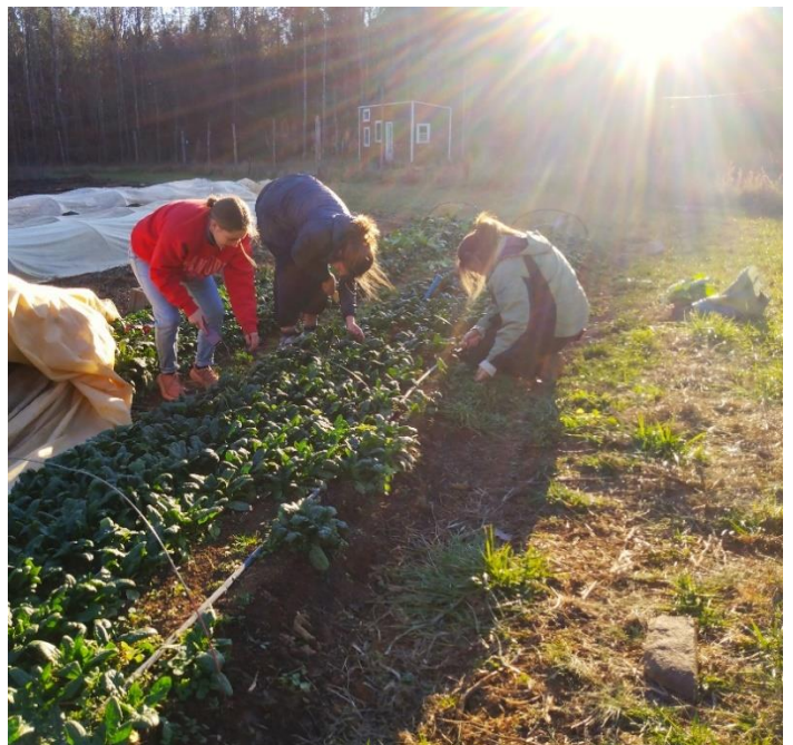
Growing and harvesting food is a year-round operation Banner above: Purple Archangel ( lamium purpureum ) licked with frost