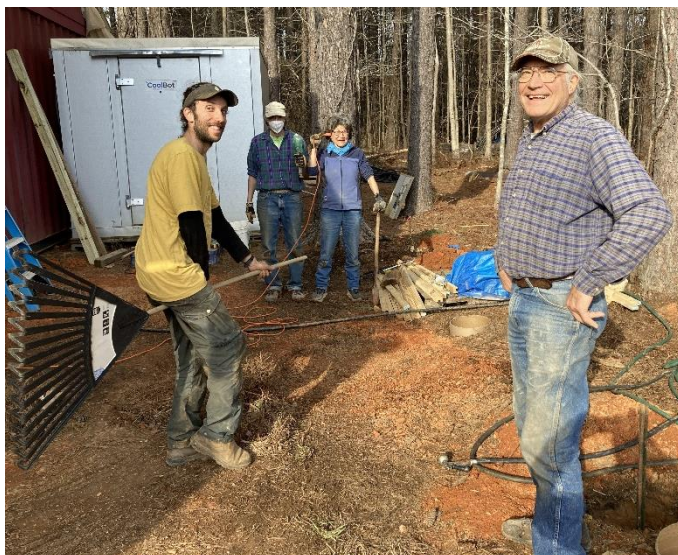
Revelling in a good day's work on the ship-&-pack Station