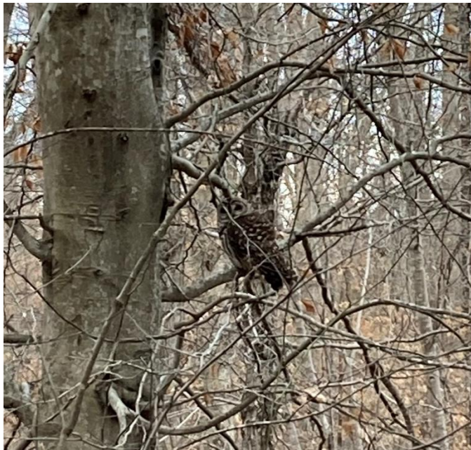
Glimpsing a barred owl silently pausing on a beech tree branch