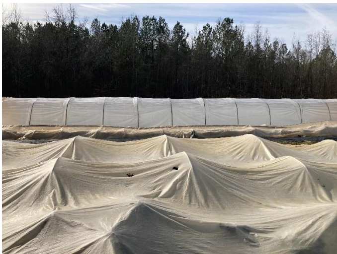
Undulating waves of plastic protect tender winter greens