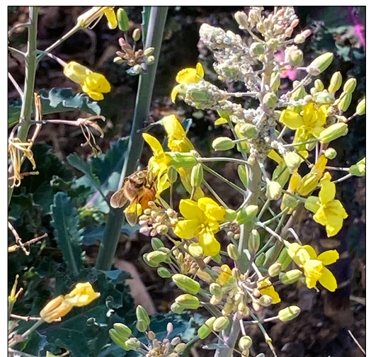
A honey bee dines on kale flower nectar.

If you're interested in contributing to the work of the IT Task Group, please email IT@commonground.eco . (Note: You don't have to be a techie ...)