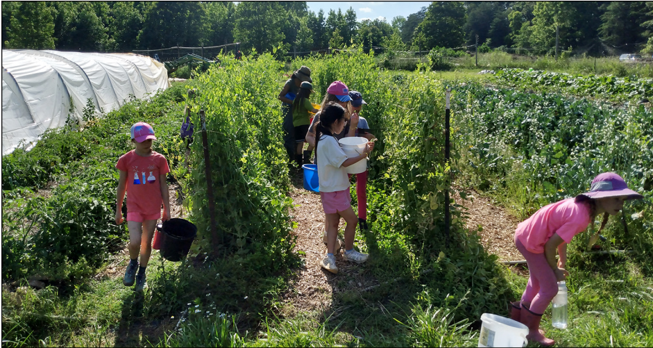
Children pick sugar snap peas on the Farm.