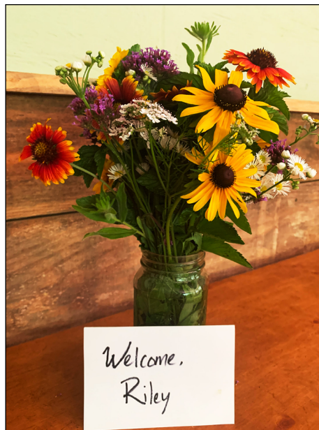
A bouquet awaits our new intern.