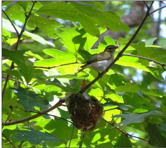
Mama red-eyed vireo keeps a watchful eye on her two nestlings.