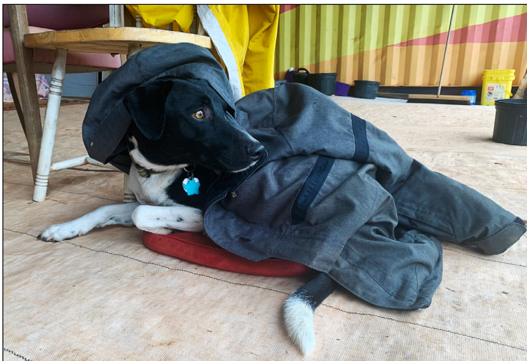
Even Bubbles the farm dog is chilly on this November day.