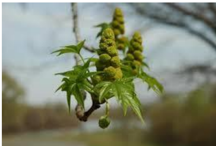
Seldom seen Sweetgum flowers (Photo- here )

Donations: to benefit Sonam's Summer Tour Many CGEV members have enjoyed these concerts. I hope you'll come to our spring concert, featuring Bridge of Song by Veljo Tormis. We will sing some of our very favorite music from Finland, South Africa, Estonia, Latvia, and more.