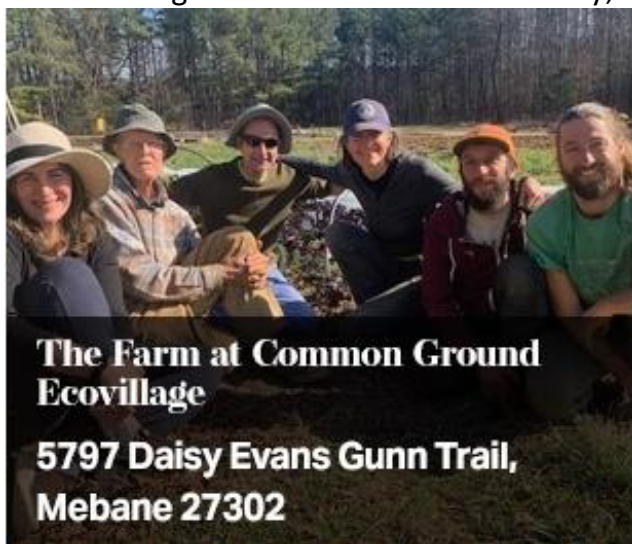
The Farm at Common Ground Ecovillage 5797 Daisy Evans Gunn Trail, Mebane 27302

The Farm at Common Ground has been selected as a “Kickoff” farm on the Piedmont Farm Tour , April 26-27. Our doors will be open from 12-6 to hundreds of ticketed visitors eager to learn about our Agrarian Intentional Community,