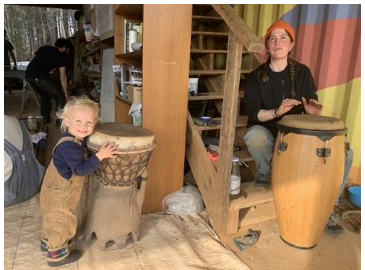
Drumming is fun!

The Farm at Common Ground is participating in the Piedmont Farm Tour on April 26-27. Our farmers are deeply rooted in practices to cultivate a healthy and vibrant foodscape and community culture every day, all year long. We strongly encourage CGEV folks to come and learn about—and serve—our agrarian mission on the land. What can you do to support and enjoy this event? Come early to set up – festivities start at noon. Staff the CGEV information booth to introduce people to what we are doing here. Take a tour—or offer one—of the surrounding land. Above all, soak in the beauty and wisdom of the plants and people who make all this possible. Extra credit: come on Sunday, too! No need to be there the entire time—drop in for as long as you can.