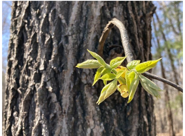
Hickory tree leaves are popping out

the promise of some berry-laden branches in no time at all! I think every LSC member had at least some part to play in getting the plants in the ground and at least a half dozen other community members helped significantly too. A total team effort. ♦ Besides the berries, the beavers are continuing their stewardship of the wetland areas. The warmer mornings make it more enticing to go down and visit them just after sunrise. Be quiet and you may be able to spot one swimming out from their lodge, just 25 yards from our trail. On the other side of the land, close to the pond, the Chicasaw Plum trees offered a rich banquet for pollinators. If you missed this fragrant ephemeral show, put it on your calendar for next year! It's free of charge :)