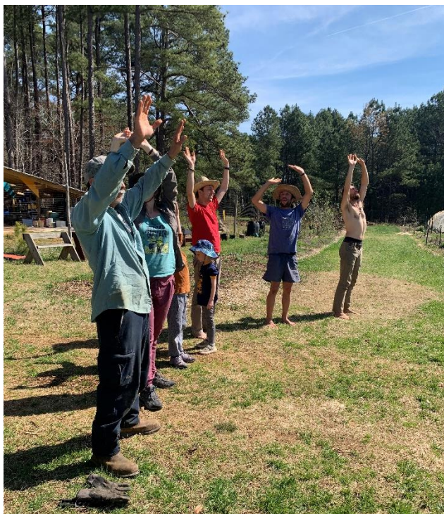
The Farm team salutes the Sun