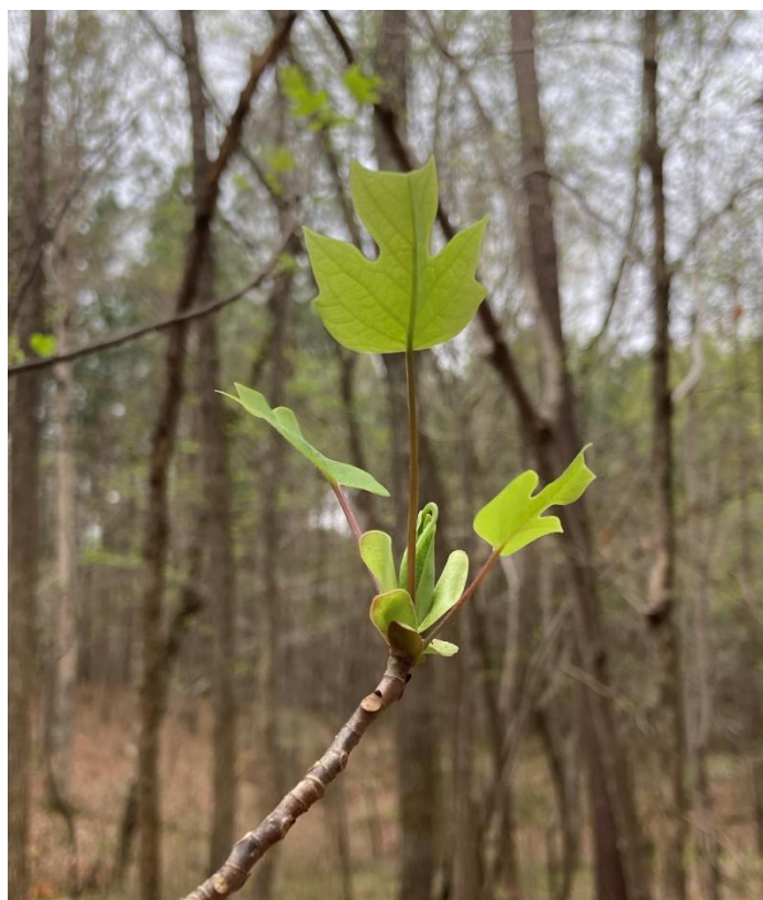
Tiny Tulip Tree leaves wave to the sun

Soaring into song. Brilliance casting winter shadow out. Slowly. The buds opening slightly more each day. Pay attention and you may catch multiple moments of magic. Is that a stick? Or is that a wand? Gathering life force as we bring forth another go round. We. As in us hu-folk and the rest of the living world around us and within us. The dazzling co-creative mysterious unfolding we call life. We're past the Spring Equinox and the world could not be more alive out at Common Ground. Come on out and get involved!