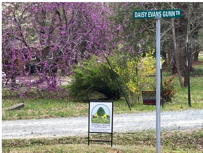
CGEV—you can't miss us!