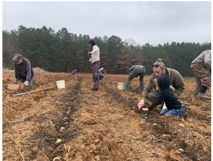
Planting progresses at the Potato Palooza