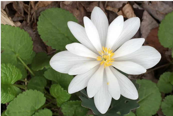
A Bloodroot blossoms near McGowan Creek

A keystone of Sociocracy is governance by Circles. Each of our four Functional Circles (FCs) has a discreet Domain defining their overall purpose, specific Aims spelling out what they deliver for the community, and Priorities for the road ahead (DAP). The General Circle, comprised of two members from each FC, reviews and consents to these DAPs every year. We encourage you to take a close look at how the work of these Circles helps to bring CGEV alive. And they need YOU to keep up the good work. As we've learned in our NVC classes, one of our most basic needs as a human is to make a contribution. Click here to review each Circle's DAP and notice where you feel resonance, even excitement, about what you could contribute to co-creating this great work. Then contact the Circle leaders listed in the "Meetings" section. Your essence, gifts and skills will be so very welcome and needed!