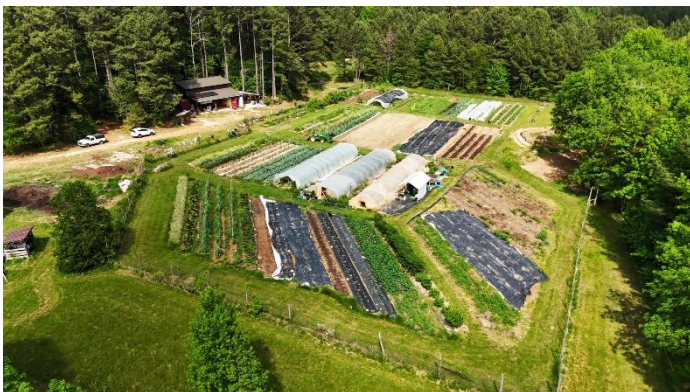
A drone's-eye view of the farm in May

On the other hand, the squirrels continue to be a menace. A few crafty ones scampering up a drain pipe and flung themselves onto the open window edge to chew their way through the screens of the window in the 2nd floor barn kitchen. They then proceeded to collect butternut squash seeds Doug was organizing and plant them into celery flats that were in the room to stay cooler for germination. A few days later and voilà, up sprouted new butternut squash plants. If only we could train the squirrels to plant all of our seeds in exchange for moderate pillaging of the corn ears, we would take them up on that exchange!