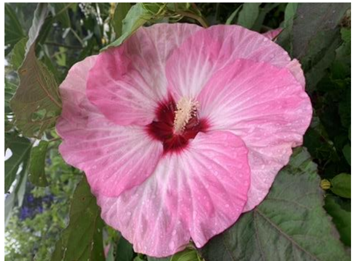
Ginormous hibiscus blossom

Group since we will choose a new selection to read.