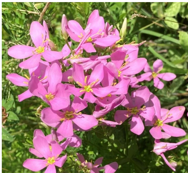
Wild Rose Pink graces the Far Field

Common Ground is an agrarian ecovillage. This means that growing nourishing food and cultivating loving care for the land and all beings are paramount for us. It's a holistic vision and we are called to honor inter-relationships in all we do.