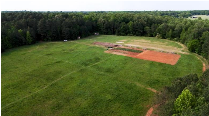
Overview of the Far Field