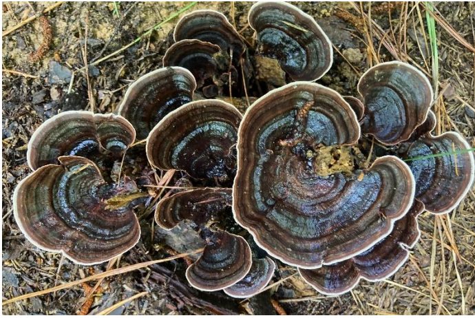
A kaleidoscope of mushrooms

Preparing hearts and minds: When we committed to going ahead with construction we also committed to taking care and giving heart to preparing ourselves and the land beings as best we can for the disruptions and changes to come. Randy, Janey and Doug are moving this work forward, most recently with the establishment of a Tree Team to give special care to the grand old trees that will be coming down near the entrance.