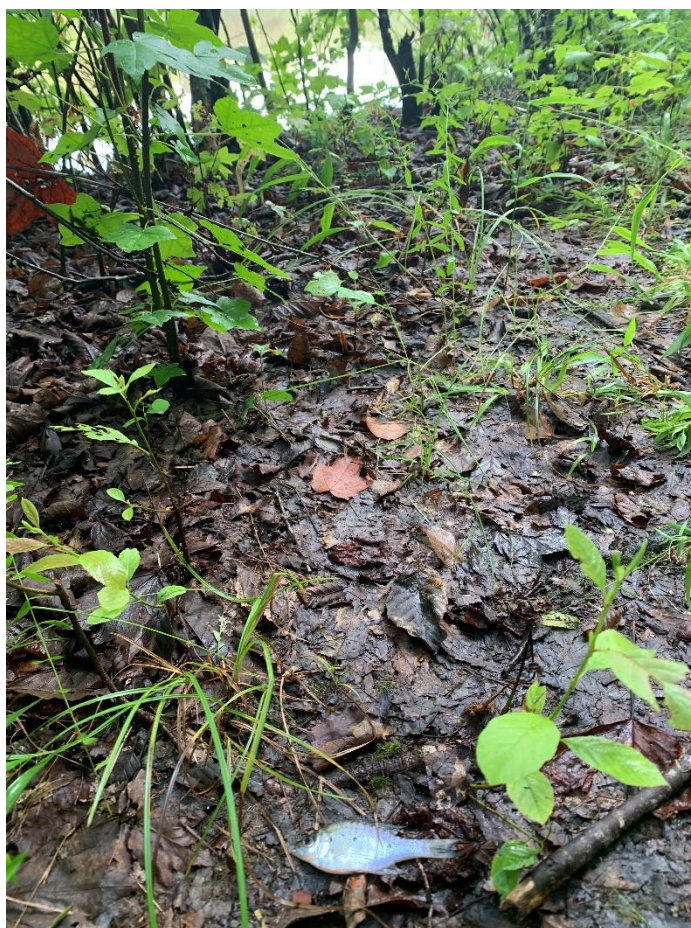
Tropical Storm Chantal caused the pond to swell up over the bank, washing up this little fish in the process

Potlucks are our time to break bread together and socialize, play, sometimes chew over the Community on the Ground meeting content. Please bring something to share. Vegetable dishes typically predominate, but all sorts of food are welcome. Just bring a list of ingredients or jot them down when you come. Make it a habit to come to these events!