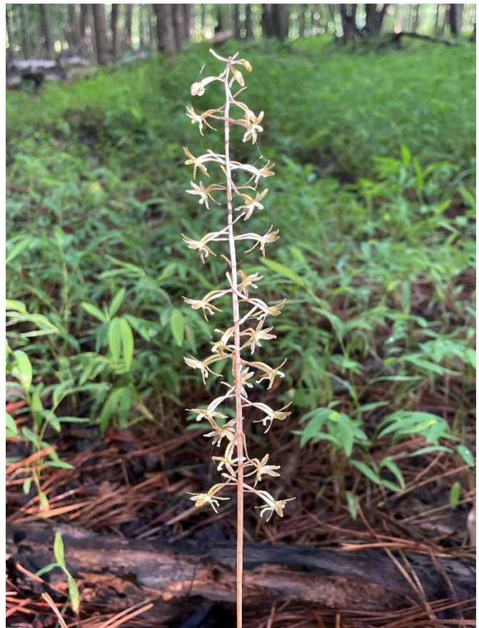
Delicate Crane fly Orchid emerges