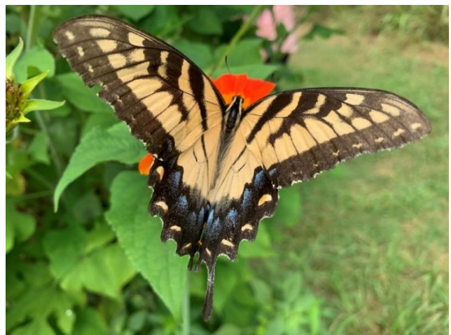
Swallowtail butterfly sips nectar from a Zinia

Thursdays, September 4 and 18, Zoom. Task meetings, as needed, are on alternate weeks, same time. RSVP to Lisa with subject "Membership Circle"