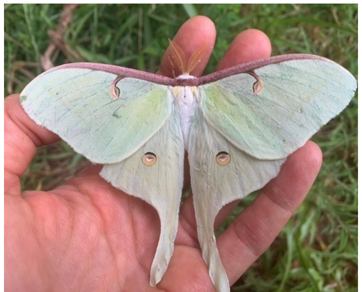
Luna moth at journey's end