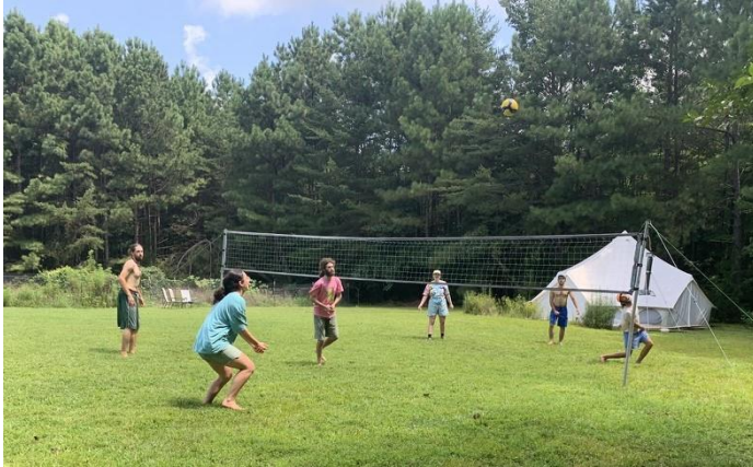
A spirited volleyball game happens at the Nest

at proposed plans. Note that the initiative lies with member-builders to bring forward developed plans (fairly early in the design process, please!) or ideas or requests to consult. P&D is also in discussion with a Durham-based design/build firm for possible shared designs and construction management – more on that very soon. Designing and preparing to build has enough lead time and it is definitely not too early to begin working on it.