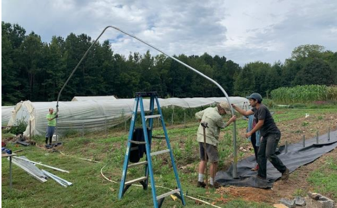
The first high tunnel rib is slotted in place

the growing season. High tunnels protect against extreme weather conditions, allow for greater crop diversity, reduce the need for pesticides, and provide comfortable working conditions during the winter months. Now we have what we need to build a high tunnel and a greenhouse.