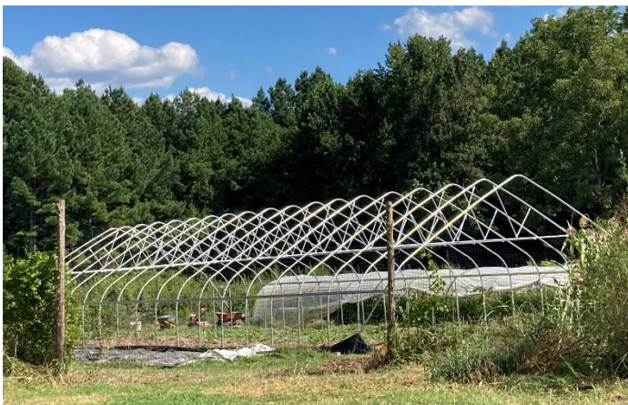
What a difference a couple of days makes