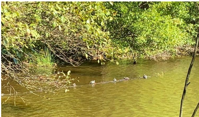
Many Turtles sun themselves on a pond log

In the month of September there were seven JOIN forms submitted by new visiting members one of whom is an original co-founder of our community. Every new member receives a welcome letter with ideas for learning more and getting involved. We are holding new member coffees and all are welcome.