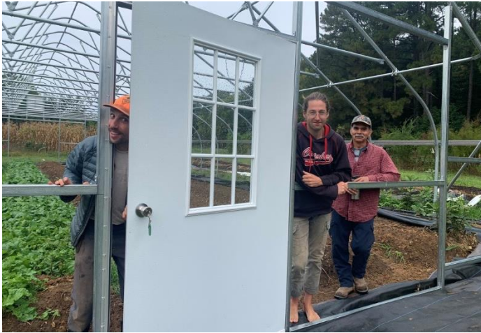
Peeping through the High Tunnel door

course and/or are due (for membership advancement) for cooperative culture and NVC training, then please contact Ren to schedule it.