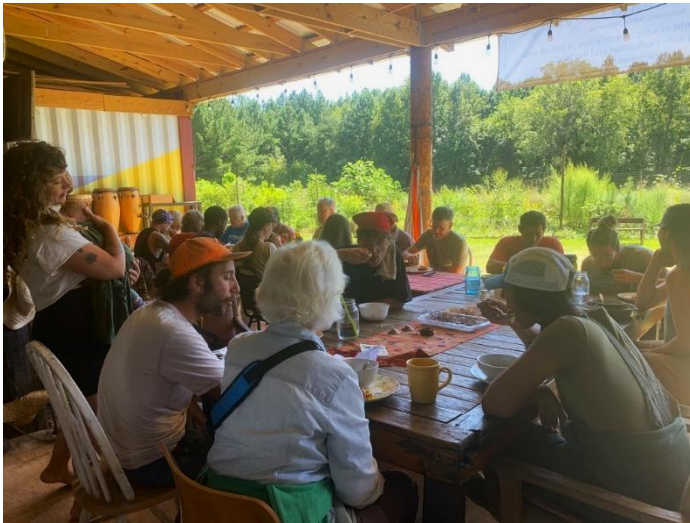
Tuesday Farm lunches are delicious fun—join us!

accountants are working this over, and members got a broad-scale intro to it at the Sept. COG meeting.