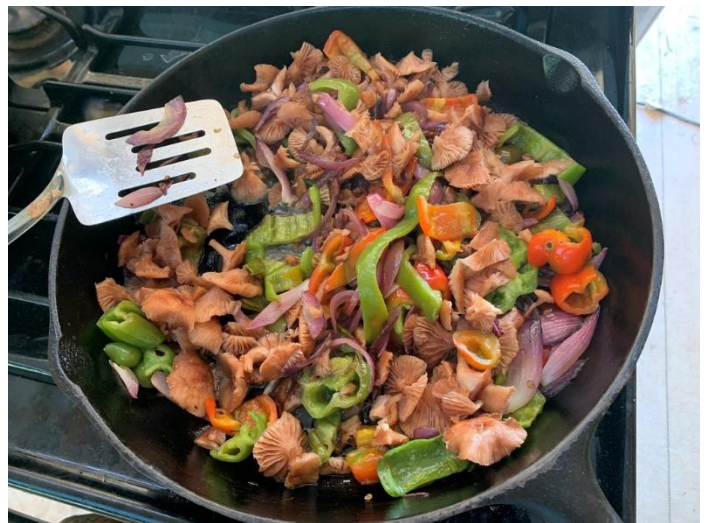
Just another delicious farm-cooked dish

This is a great opportunity for those who are curious about CGEV and want to make connections with other members.