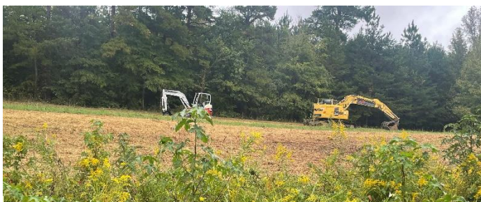
Excavators are parked and ready to go

Infrastructure construction is imminent! Task Teams to prepare the land and all its creatures for development are still forming and working NOW. We need EVERYONE to volunteer to bring tender loving care to the land as we proceed. Contact Janey and/or sign up at this link . Many ideas are listed in this spreadsheet and there's room for more.