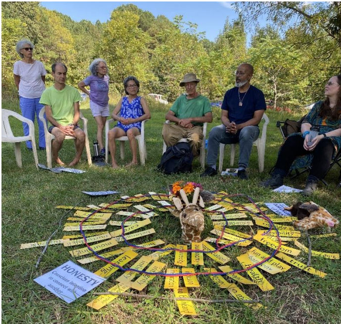
Spiral of feelings and needs at an NVC event

pond before it is drained and refurbished. • Wildflower Re-location Team • Wildlife Thicket Team to create thickets adjacent to areas of tree felling, Etc.!!! More volunteers are needed— Contact Janey meadows.maryjane@gmail.com and/or sign up at this link . Many ideas are listed in this spreadsheet and there's room for more.