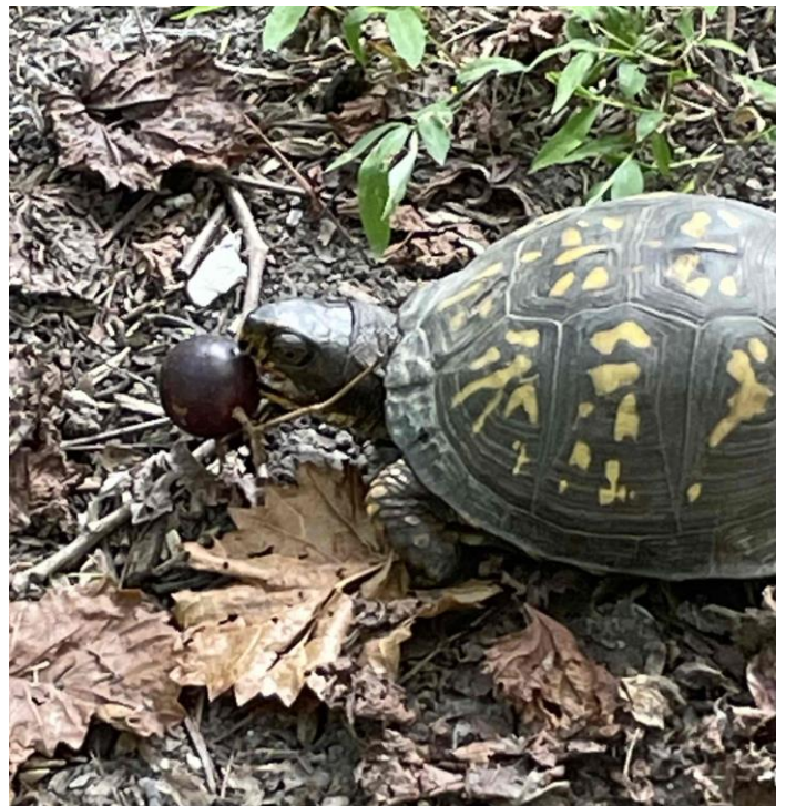
Box Turtles like Muscadine grapes, too, (Photo: Margret)

Come enjoy a simple, nourishing meal prepared straight from the garden plus thoughtful conversation with good humans who care about the earth. In order to put these meals on every week, we need support. This can be a chance for you to learn the skill of cooking for a community with what's seasonally available. Lucas can help you plan the menu and get everything ready to put on a yummy farm-to-table meal for other community members and visitors. Please sign up to support the cooking or the post-meal dishwashing here . And remember to offer donations—cash, Venmo, or pantry staples are much appreciated (olive oil, rice, beans, lentils, GF flour, etc...)