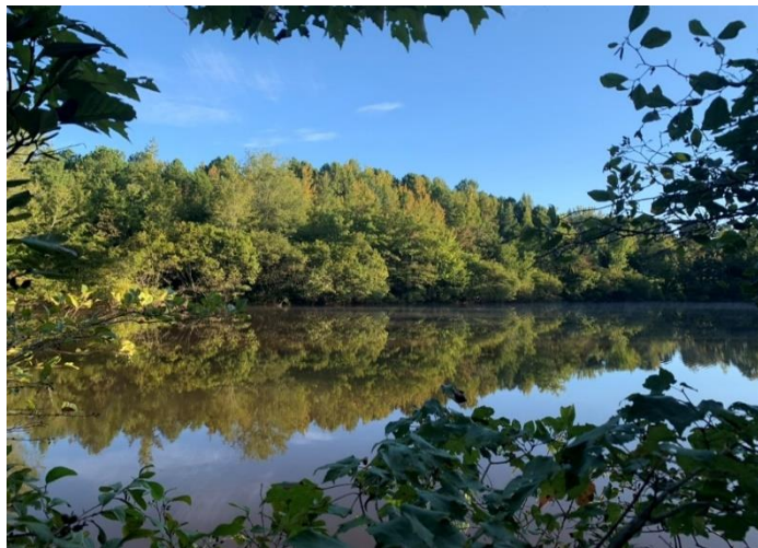
Autumn stillness at the pond