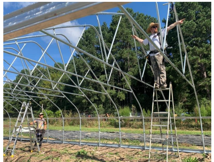
Work to complete High Tunnel construction is nearing completion

Potlucks are our time to break bread together and socialize, play, sometimes chew over the Community on the Ground meeting content. Please bring something to share. Vegetable dishes typically predominate, but all sorts of food are welcome. Just bring a list of ingredients or jot them down when you come.