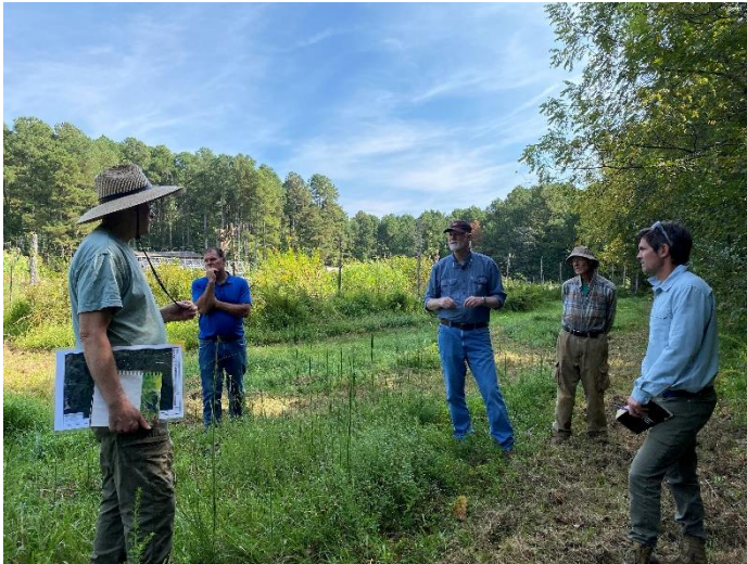
The development team and Doug review where the erosion control silt fences will be located

September was another hugely eventful month in the grand epic of Common Ground Ecovillage. The big news is that we have given MEC (our main infrastructure contractor) the green light to start construction and have received approval from Orange County Erosion Control to begin work. Equipment and materials are already showing up on the land. Randy and Anthony are coordinating with MEC. We have given them approval to pursue their first tasks of erosion control protection work, including fencing, two new temporary drainage basins, and ditches to convey water to the basins, all of which should take 3-4 weeks.